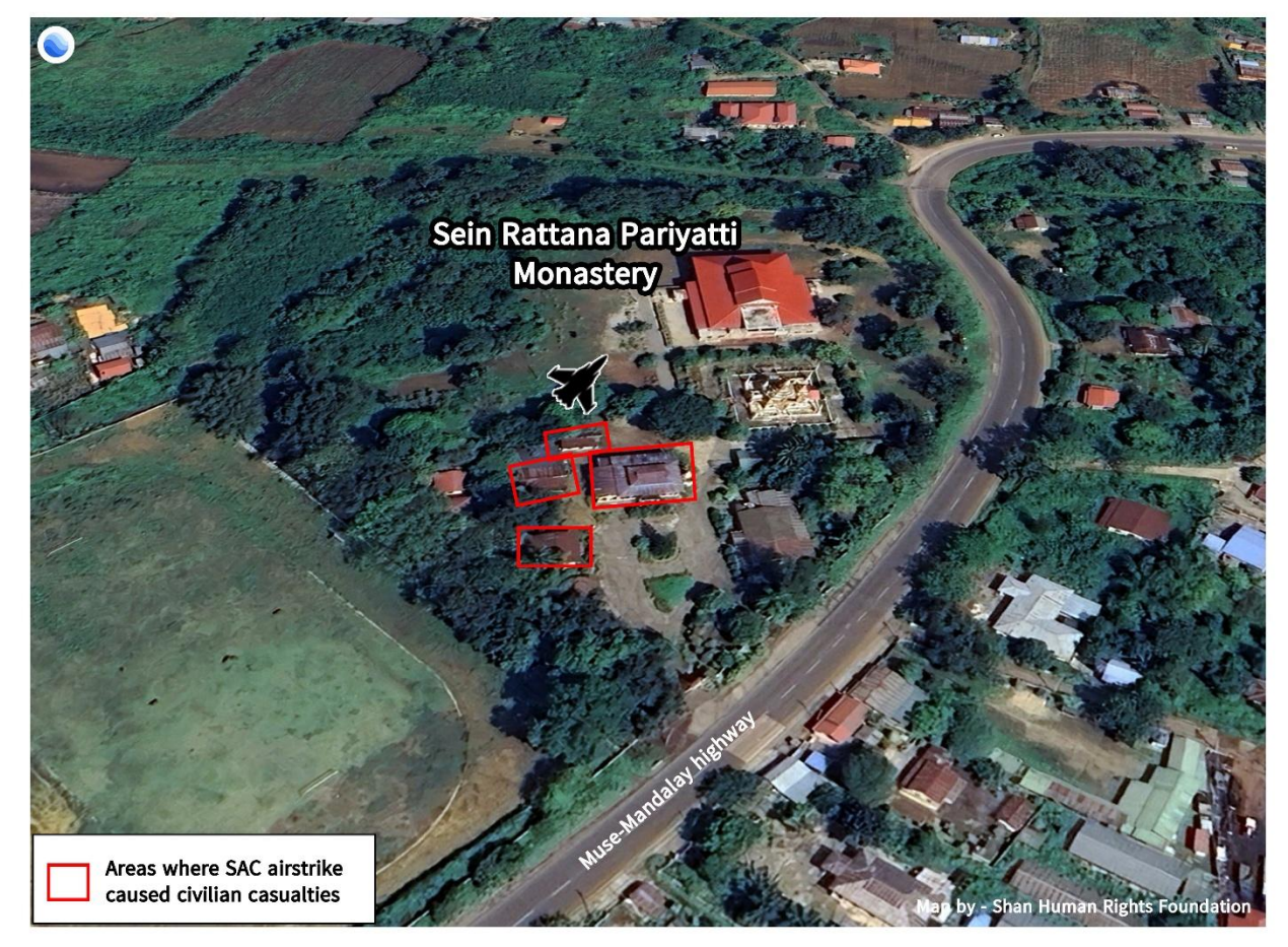
SAC airstrike on Sein Rattana Pariyatti Monastery on March 16, 2025

The bombing damaged four monastery buildings, including the main temple, a monk hostel and two novice hostels. Three cars and two nearby houses were also damaged. There were five monks and 60 novices (aged 5 to 16) living at the temple, and over 200 IDPs from Nawngkhio town, who slept there at night for safety. There were no armed personnel staying at the monastery.