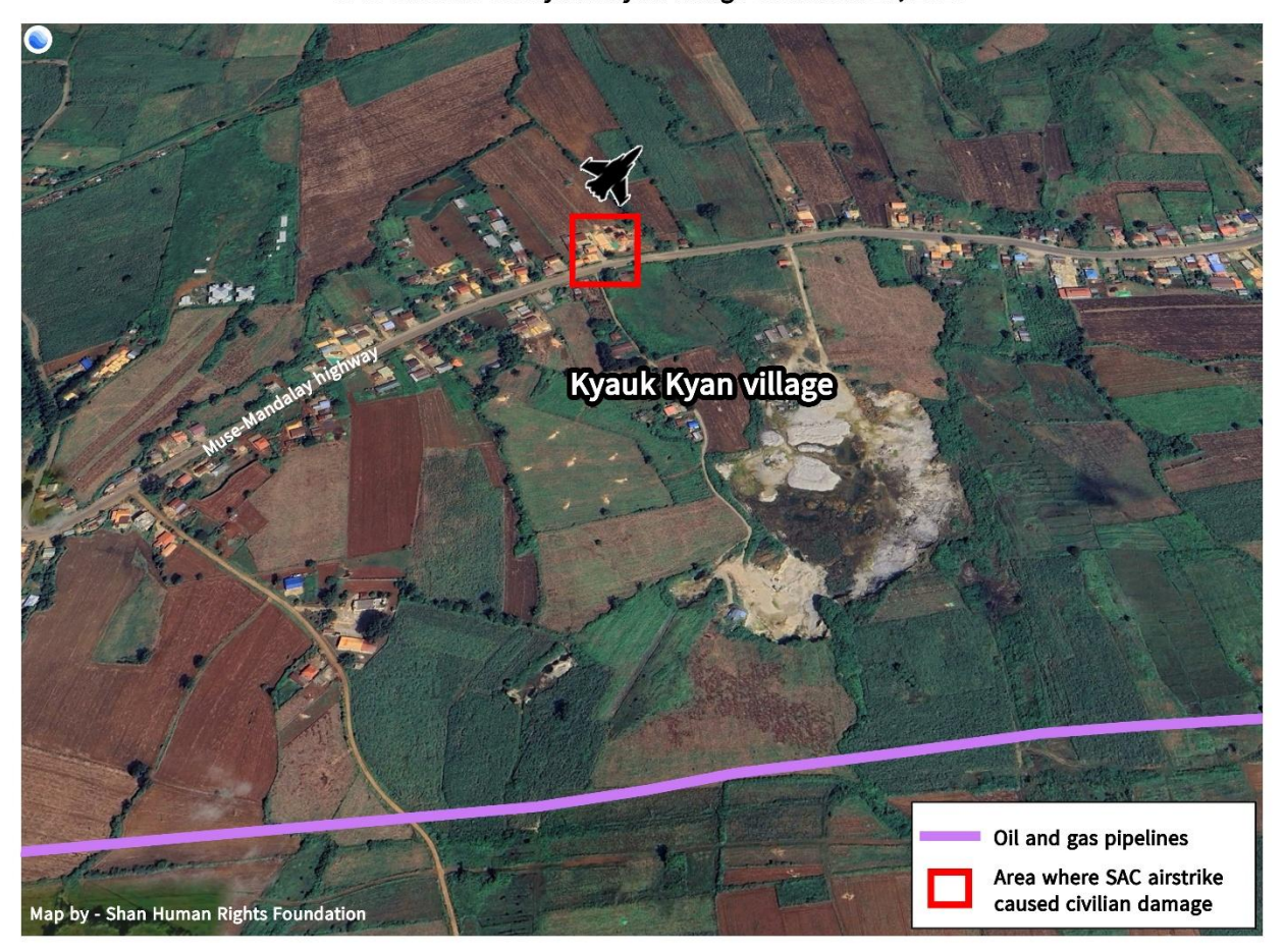
SAC airstrike on Kyauk Kyan village on March 17, 2025

On March 17, at 11:45 am, two SAC fighter jets dropped two bombs and fired machine guns into Kyauk Kyan village, five kilometers west of Nawngkhio town. The bombs fell about 700 meters from the Chinese oil and gas pipelines. Several houses were damaged by the bombing.