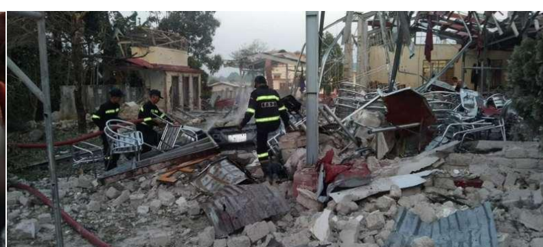
Sein Yadana Parayatti monastery building destroyed by SAC 250 lb bombs