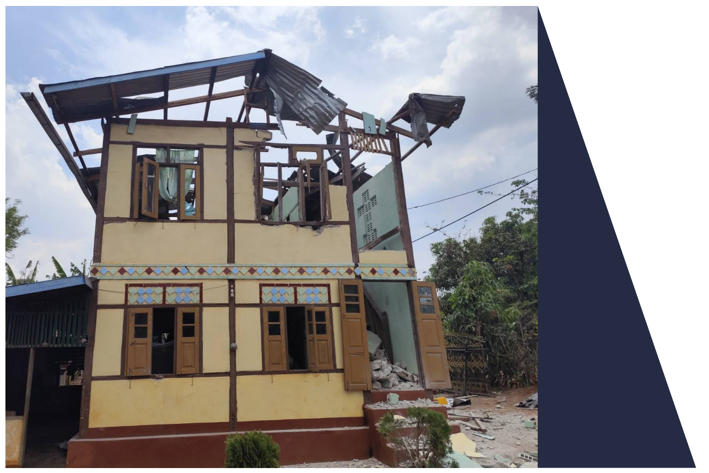
Photo: On 10 May, junta battalion 102/427 attacked homes in Western Demoso at 11:30 PM. Several properties were damaged. The firing took place without any active conflict.

Attacks from the air threaten civilian security and safety and are of pressing concern, given that there is insufficient medical capacity to treat all victims.