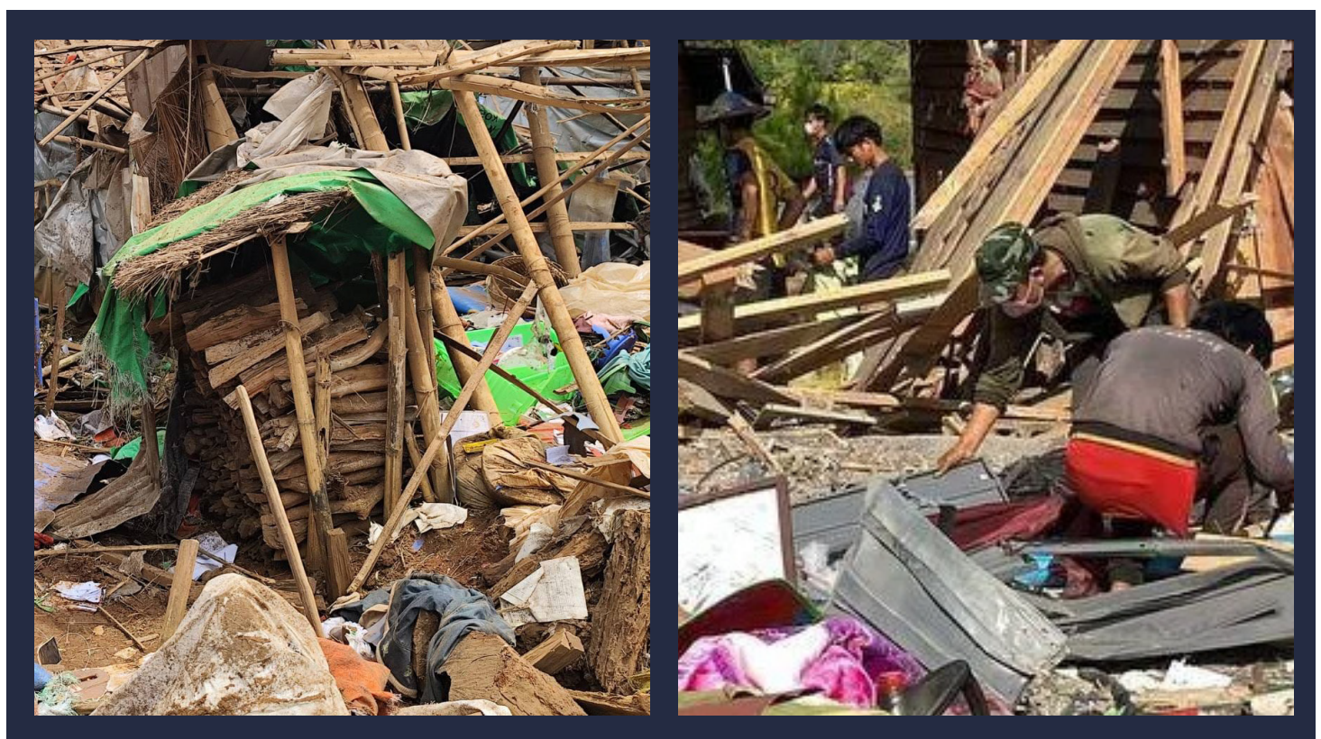
Photo: On the evening of September 5th, targeting a camp for internally displaced persons called the Bangkok IDP camp in La Ei village.

When mothers are denied nutritious food, their health suffers, and they cannot access reliable treatment. Women who carry their pregnancies to term face additional fears and challenges after giving birth, including malnutrition and vaccine availability. They also worry that their infant might become ill due to the changing climate and the lack of warm clothing and materials.