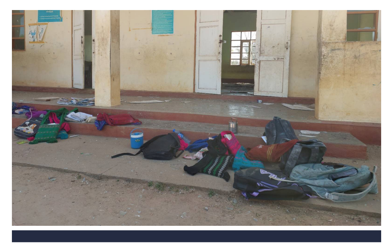
Photo: The terrorist regime targeted two schools. Daw Si Ei school was hit by a series of bombs in February 2024, including one weighing 500 pounds. Four young boys between the ages of 12 and 14 years were killed. At least fifteen children were injured, including those under the age of three.

As long as the junta has access to jet fuel and large-scale weaponry, civilians' lives will continue to be endangered. As highlighted in various campaigns advocating for aviation sanctions, if the warplanes cannot fly, they won't be able to bomb.