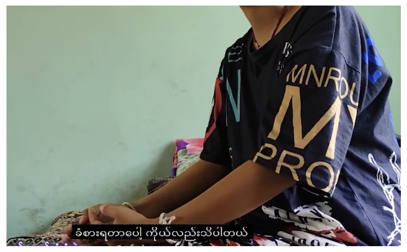
Photo: Civilian casualties are continuing due to landmines planted by the junta. The Karenni Human Rights Group recorded this video about a woman who was injured by a landmine.

Two displaced men from Pekon township were also wounded by landmines while returning to their communities with rations and medical equipment for a clinic.