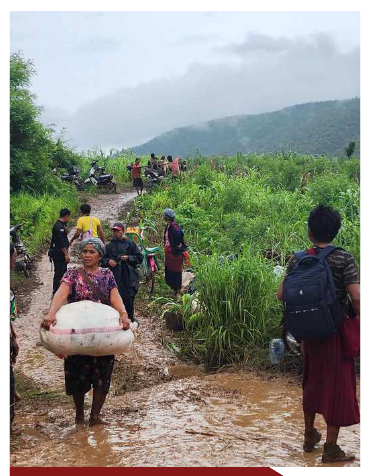
Photo: T emporary shelters and camps in Loikaw, Demosso, Pha Saung, Shar Daw townships faced flooding and landslides during Typhoon Yagi.