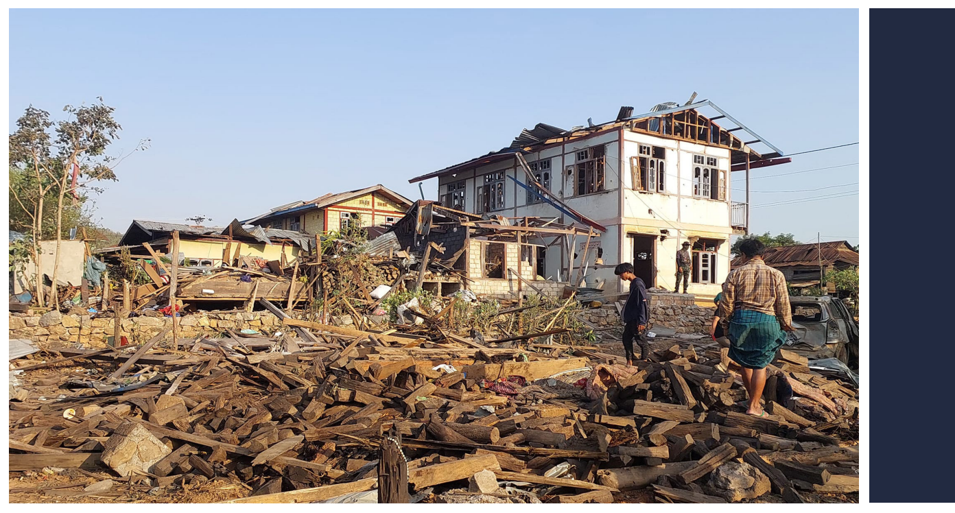
Photo : Six civilians, including two children, were killed, and more than 20 injured when the junta bombed Kone Thar village in Loikaw Township on April 20, 2024, at 11 AM. More than 20 houses were destroyed.