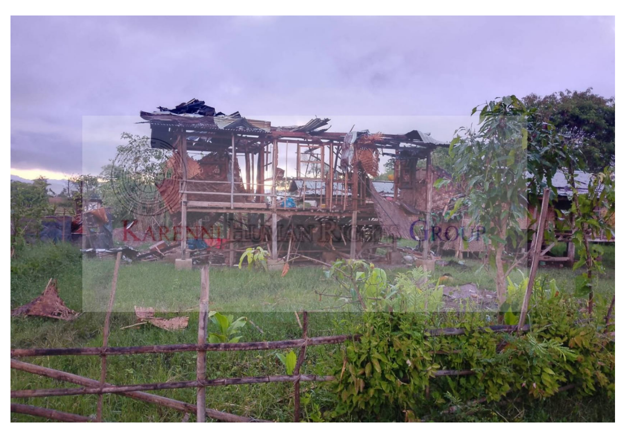
Photo: On October 26, between 5 and 7:00 PM, the junta deployed large weapons and artillery, which damaged four homes and two classrooms when they exploded.

In November, mortar shells destroyed two houses, and airstrikes damaged five buildings, including a church. By December, KnHRG reported that 78 properties were damaged throughout Karenni State, mainly by airstrikes and artillery firing and shelling.