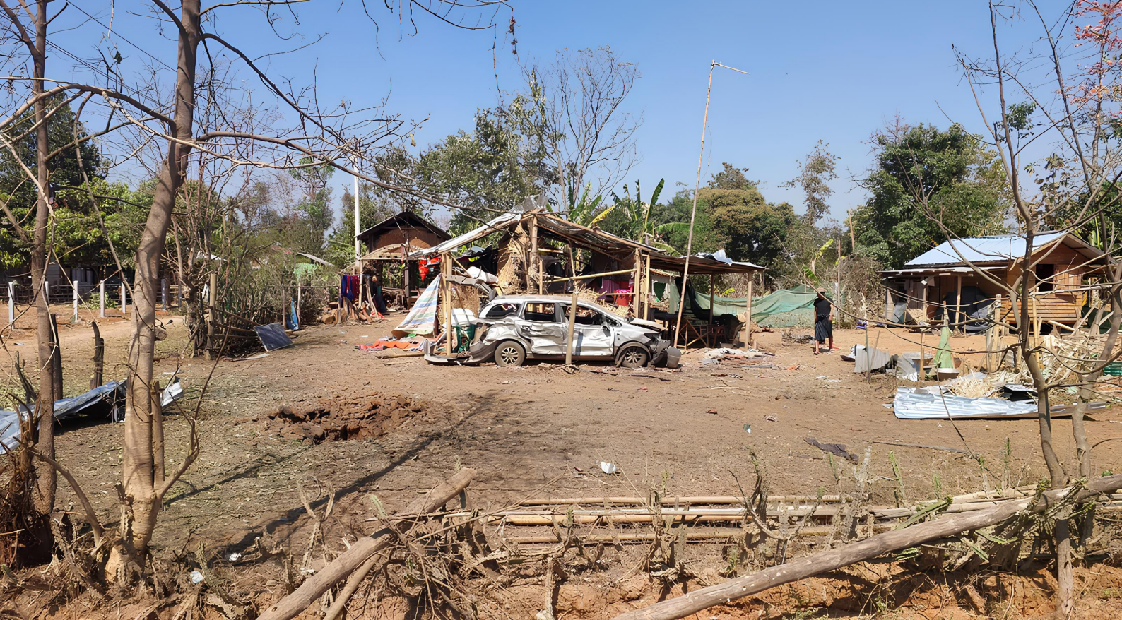
Photo: The bags and backpacks of school children in the aftermath of ten airstrikes by the junta in Demoso Township, Karenni State, on 5 February 2024 at 10:15 AM with three jet fighters, in addition to six rounds of mortar shelling on two schools.

Daw Si Ei school was hit by a series of bombs, including one weighing 500 pounds. Four young boys between the ages of 12 and 14 years were killed. At least fifteen children were injured, including those under the age of three. The second attack on Loi Nan Pa claimed the life of one man, and two teachers and five civilians were injured. Six other buildings and one church were damaged, and five homes belonging to IDPs and locals were also destroyed by the relentless firing.