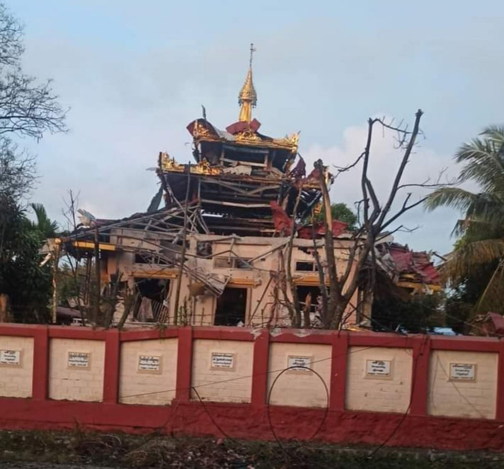
Photo: Additional damage and destruction as a result of fighting in Loikaw, Karenni State.