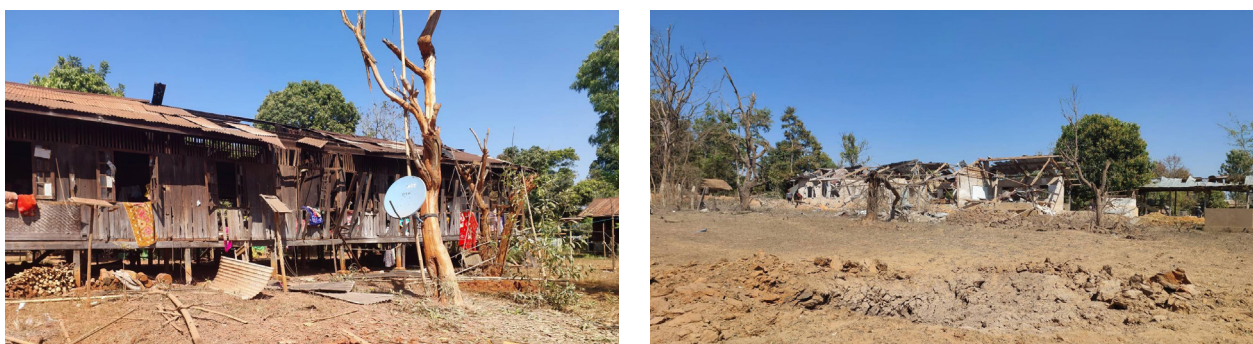
Photo: Damaged buildings after the terrorist regime targeted two schools. Daw Si Ei school was hit by a series of bombs, including one weighing 500 pounds. Four young boys between the ages of 12 and 14 years were killed. At least fifteen children were injured, including those under the age of three.

Additionally, six other buildings and a church were damaged, and five homes belonging to internally displaced people and locals were destroyed by the firing.