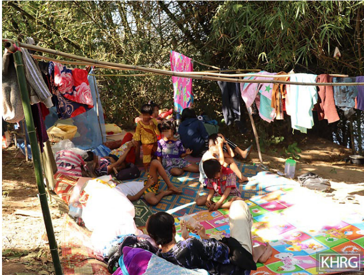
This photo was taken in December 2021. It shows displaced villagers from Tl--- village, in Tm--- IDP site, Palu village tract, Kaw T'Ree Township, Dooplaya District, near the Thai-Burma border. Approximately 1,000 villagers from Palu village tract, including Lay Kay Kaw area, fled after the SAC conducted ground and air attacks in the area on December 15 th 2021, following fighting between combined SAC and BGF troops against KNLA troops in Lay Kay Kaw area.

Air strikes often separate children from their families and communities and children face difficulties reuniting with their families and communities in safer areas. Many students are forced to flee alone, taking minimal resources with them, and struggle to continue their education. Efforts are made by the community to continue education for students amidst these conditions, including building makeshift classrooms and arranging flexible schedules. Some children flee unaccompanied to third countries to continue their schooling, although such programs do not include Karen language and culture, and some face discrimination in neighbouring countries.