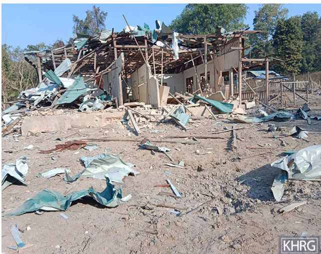
This photo was taken on January 2023 in Zw--- village, Meh Thu village tract, Dwe Lo Township, Mu Traw District. It shows Wl--- clinic (administered by the KDHW) destroyed by the SAC air strike. On January 7 th 2023, at 10 am, SAC fighter jets conducted an air strike in Zw--- village and dropped five bombs on the village. The clinic and healthcare workers' rooms were destroyed.