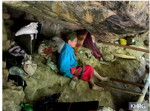
This photo was taken April 2021 in a cave in Lu Thaw Township, Mu Traw District, where villagers from Day Bu Noh area, Pay Kay village tract, Lu Thaw Township were seeking refuge after the SAC bombarded on March 27 th 2021. The picture shows an elder woman, who was over 100 years old at the time of displacement, sheltering in a cave.

Displacement exacerbates the challenges faced by all villagers, especially vulnerable populations including those with chronic health conditions or other specialised needs. The lack of accessible medical care and appropriate resources during displacement further impacts their health and safety. Ensuring that displaced persons receive specialised support and services is crucial.