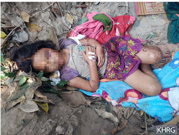
This photo was taken in March 2021 in Day Bu Noh area, Pay Kay village tract, Lu Thaw Township, Mu Traw District. This photo shows an injured girl receiving treatment in an informal displacement site after the first air strike on Day Bu Noh area on March 27 th 2021.

Since March 2021, the SAC has continued to regularly conduct air strikes on Day Bu Noh area, with air reconnaissance often being used prior to attacks. As such, villagers remain displaced, vigilant and in constant fear, with one villager reporting fears of rebuilding the destroyed houses and community buildings. Saw At---, who lives in Yh--- village, Day Bu Noh area, explained: "After that air strike [on March 27 th 2021] was conducted, SAC military jets kept coming back continuously to conduct reconnaissance and therefore, villagers continued to stay in their hiding places. [...] There are only around one third of villagers who have come back to stay in Yb--- village". According to KHRG documentation, the SAC has conducted air strikes at least 13 times in Day Bu Noh area from March 2021 to March 2024. The attacks after March 2021 have caused at least two civilian casualties and the destruction of at least 21 houses, one church, and plantations. 47 Naw An---, gave his view on the reasons for the extensive attacks on Day Bu Noh area: "I felt like their aim is to destroy all the buildings in the areas whether clinics, district office, or all the military areas [KNLA bases] in the brigade". Naw Av---, a Yb--- villager, also said: "They [SAC aircraft] fire at everything that they see."