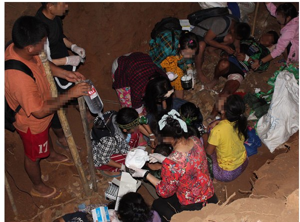
This photo was received from a KNLA medic in April 2021. This photo shows a trench in the forest where KDHW staff was providing medical treatment to villagers injured by the bombardment on March 27 th 2021 on Day Bu Noh area, Lu Thaw Township, Mu Traw District.

Local healthcare workers are also limited in their operations to KNU-administered areas due to risks associated with active conflict, SAC attacks, and having to cross multiple SAC checkpoints, where they face arrest and confiscation of supplies. Naw Bw---, the head of BPHWT in Kler Lwee Htoo District, also explained some of the mental health impacts of air strikes on the operation of healthcare workers: Regarding the mental health situation, everyone is afraid. [...] This fear impacts us. [...] When they [aircraft] flies over, our hearts beat fast. We are afraid. Due to this situation, we couldn't reduce the feeling of fear among our workers. They have conducted air strikes twice [in her area]. So, we couldn't say that they wouldn't conduct it again. [...] It affected our mental health by causing insecurity and fear. Even when we hear the sound of aircraft, we want to run. We couldn't live still [without being vigilant]. Our workers also have to be afraid while they are providing treatment to civilians. While we provide treatment to the patients, we remain afraid. " KHRG has previously documented the direct attacks on humanitarian aid delivery by Burma soldiers. 79