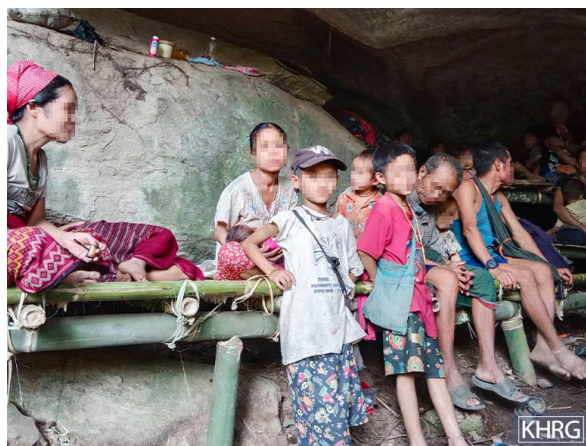
This photo was taken on March 2024 in Meh Klaw village tract, Bu Tho Township, Mu Traw District. This photo shows displaced villagers from Te--- village seeking refuge in a cave in Meh Klaw village tract, Bu Tho Township, Mu Traw District. On March 15 th 2024, the SAC conducted an air strike in Te--- village area using aircraft and drones.

Villagers described the crowded and unsanitary conditions of displacement sites as both causing and worsening health problems. As stated by Saw Ck---, from Yb--- village: “The displaced villagers had to sleep under poor conditions, so it was easy for them to get sick and develop a runny nose [...] If villagers lived separately and in a clean place, the villagers would not have been infected. The disease spreads very fast when a group of people stay together. About 100 to 200 students [children] were sick when they became infected by the disease within a week. It is contagious when people are grouped up together.” He added: “There was water pollution as so many people were using the same stream. [...] Without water sanitation, diarrhea followed.” Illnesses were commonly attributed to water contamination, particularly for those in Mu Traw District. Naw An---, who experienced the air strike in Yb--- village, Day Bu Noh area, on March 27 th 2021, explained: “There were many people crowded along the river throughout the river source. We used the water from that river to drink and bathe. Some people drink water from that river and defecate in the river. We could not go anywhere so we had to drink and poo there. [...] Drinking unclean water impacts our health and could cause diarrhea. There were over 300 to 400 [people] relying on that river, drinking and bathing.”