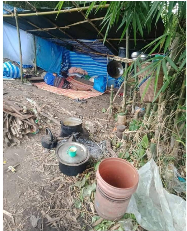
This photo was taken on March 2024 in Meh Klaw village tract, Bu Tho Township, Mu Traw District. This photo shows displaced villagers from Te--- village seeking refuge in a cave in Meh Klaw village tract, Bu Tho Township, Mu Traw District. On March 15 th 2024, the SAC conducted an air strike in Te--- village area using aircraft and drones.

Villagers also reported challenges with shelter in displacement sites. In some areas, tarpaulins, bamboo and other basic materials were obtained by villagers or provided by local leaders or local organisations, but were often insufficient or did not provide adequate protection in the rainy season. Saw Ck---, a displaced villager from Day Bu Noh area, Pay Kay village tract, Lu Thaw Township, Mu Traw District, explained: “Villagers faced difficulties during the rainy season. Some villagers slept on hammocks, and some slept in caves as well as makeshift bunkers bedded with mats and blankets. It’s been difficult for the pregnant women and mothers who have newly given birth to travel back and forth to the village from the displacement site. It’s really difficult for them to live in the forest because it is not like home.”