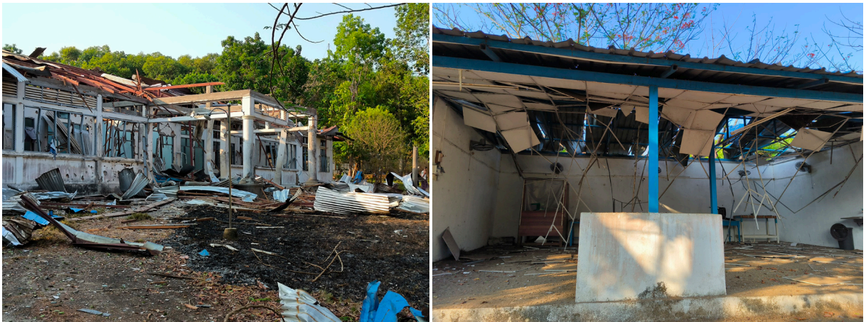
These photos were taken on May 8 th 2024 in Ys-- village, K'Ser Doh Township, Mergui-Tavoy District. These photos show Yr--- school (on the left) and Yt--- hospital (on the right) destroyed by an SAC air strike on Yr--- and Ys--- villages, K'Ser Doh Township, on May 8 th 2024.

In Mergui-Tavoy District, indiscriminate air attacks have increased alongside escalating armed conflict in the area since the 2021 coup, intensifying in 2024. In one particular incident, on May 8 th 2024, the SAC conducted an air strike on Yr--- and Ys--- villages, K'Ser Doh Township, where soldiers had been celebrating after KNLA troops captured the SAC's Pe Det army camp, located on the Mergui-Tavoy road (about 50km away from incident place). The celebration, from 9 to 11 am, was shared online, during which an SAC aircraft was seen flying over Ys--- village, conducting reconnaissance. In the afternoon, between 4 and 6 pm, a fighter jet described as flying "high up" dropped bombs between Yr--- school and a football pitch, and on Yt--- Hospital. The air strike killed 2 children (around 15 years old) and injured four other villagers, who were playing football at the time. No non-civilian casualties were recorded. A local teacher named Ay---, who was in Yv--- village, Saw Khay area, explained: "I did not expect that the SAC would drop the bombs. [...] I saw the civilians were running here and there. [...] No villagers [in Yr--- village] have makeshift bunkers. The villagers learned the technique of how to lay down when the incident happened, and they also understood to lay down [keeping the chest] two inches away from the ground" .