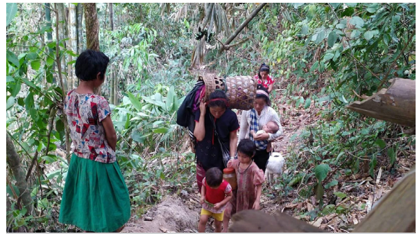
This photos was taken on April 14 th 2021 in Lu Thaw Township, Mu Traw Distirct. This photo shows displaced Cv--- villagers, from Tay Muh Der village tract, Lu Thaw Township, fleeing from an air strike on Day Bu Noh area in March 2021. Cv--- villagers were forced to displace several times due to the threat of SAC air strikes on Tah Muh Der village tract, located close to Day Bu Noh area.

Uncertainty about the risk of air strikes can persist for many months, leaving villagers in a precarious state for prolonged periods of time. As stated by Saw By--- (41 years old), the displaced village tract administrator from Wy--- village, Tx--- village tract, Htaw Ta Htoo Township, Taw Oo District, "We could hear the sound [of explosions] for 12 months". In some circumstances, villagers were unable to return to their village due to the destruction of their homes and communities caused by air strikes.