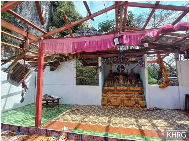
This photo was taken on February 2023 in Vc--- village, Kwee K' Hsaw Hsee village tract, Waw Ray Township, Dooplaya District. It shows a village monastery, destroyed by an SAC air strike. On the evening of 1 st January 2023, fighting happened between local armed groups and SAC troops near Vc--- village. After the fighting, on January 2 nd and 3 rd 2023, the SAC conducted air strikes on Vc--- village, destroying villagers' houses, the village monastery, as well as betel nut and rubber plantations.