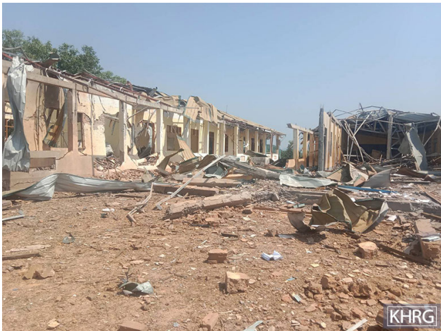
This photo was taken on March 2024 in Wo--- village, Khaw Hpoh Pleh (Min Saw) village tract, Bilin Township, Doo Tha Htoo District. It shows a KECD-administered school destroyed by an SAC air strike on March 23 rd 2024. The air strike destroyed all four school buildings, including the school materials inside. The air strike also damaged villagers' houses and injured a villager. Three bombs remained unexploded.