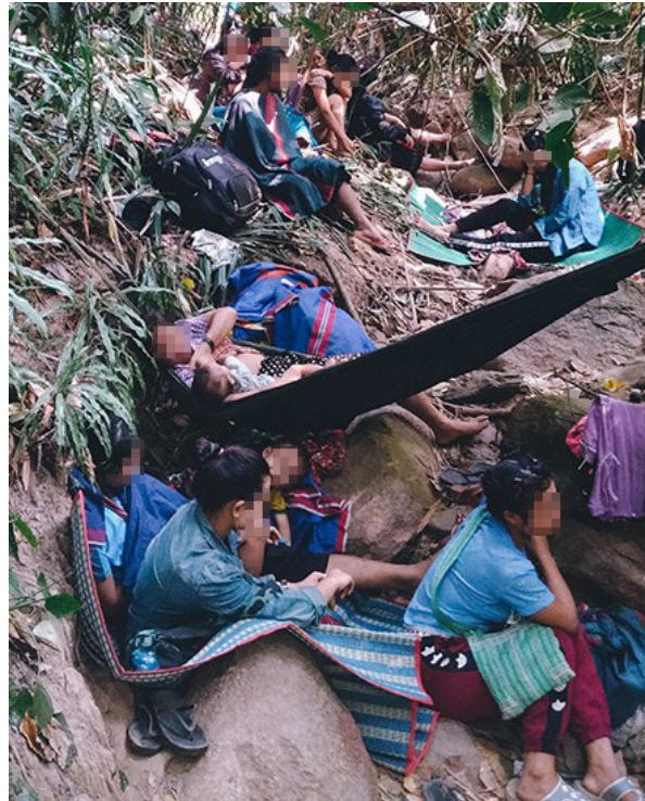
This photo was received on April 2021. It shows displaced villagers from Pay Kay village tract, Day Bu Noh area, Lu Thaw Township, Mu Traw District, hiding in the jungle after the first SAC air strike on Day Bu Noh area on March 27th, 2021. The displaced villagers are from Yb---, Yc---, Yd---, Ye---, Yg---, Yh---, Yi---, Yj---, Yk---, and Yl--- villages, Day Bu Noh area, Lu Thaw Township, Mu Traw District. Since March 27 th 2021, SAC air strikes forcibly displaced at least 15,000 villagers from Mu Traw and Kler Lwee Htoo Districts.

The threat of, and constant, unpredictable nature of air attacks often makes it impossible for some villagers to return to their villages for prolonged periods. This has been the case for many villagers from the Day Bu Noh area, who have remained displaced due to ongoing risks of attack since March 2021, and have expressed fears of rebuilding their villages. Similarly, many of the tens of thousands of villagers who were displaced to the Thai border after the bombardment of Dooplaya District over the Christmas period of 2021 remained displaced after the SAC continued its air offensives from January to May 2022 primarily targeting Kaw T’Ree Township, near Kawkareik Town, Lay Kay Kaw Town, and areas along the Thai-Burma border. Due to ongoing fighting, ground and air attacks in the area, as well as the occupation of villages and the presence of SAC troops, many villagers have remained displaced since December 2021. Some villagers from this area attempted to seek refuge in Thailand but were pushed back into Burma. 71