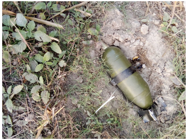
This photo was received in February 2024. On February 17 th 2024, at around 11 am, SAC LIB #439 conducted a drone attack in Wr--- village, Hkay Kyi village tract, Moo Township, Kler Lwee Htoo District. Bombs were dropped, causing a villager’s house to burn. This photo shows one of the unexploded bombs dropped by the SAC drone.

place [a distance of approximately 30 minutes by car]. We were not aware of it because we are villagers and there were no soldiers in our village, so we lived as usual. Yet, on that day [March 9 th ], in the afternoon around 3 pm, they [SAC] conducted an air strike [on Za--- village], so we were afraid and fled here and there. My house was burned by the air strike, so we did not dare live in the house anymore.” Naw A--- was able to see that the aircraft was white because it flew low above the village when it conducted the air strike. The aircraft dropped around seven bombs onto the village, while all villagers ran to hide in their makeshift bunkers.