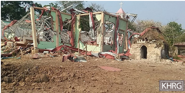
This photo was taken in April 2023 in We--- village, Noh Poe village tract, Kaw T'Ree Township, Dooplaya District. It shows a Karen Baptist church in We--- village, destroyed by a bomb from an SAC air strike on April 11 th 2023. The air strike also destroyed a village school and villagers' houses.