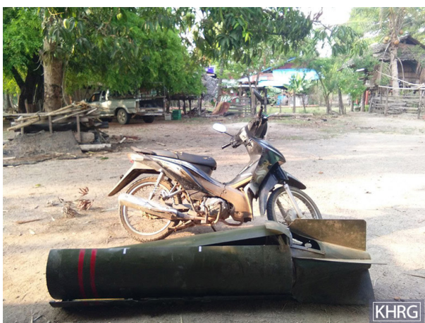
This photo was taken on April 2023 in We--- village, Noh Poe village tract, Kaw T'Ree Township, Dooplaya District. On April 11 th 2023, the SAC conducted an air strike on We--- village after fighting happened between KNLA and SAC troops in the village earlier that month. The air strike destroyed a village church, a school, and houses. This photo shows the outer canister of a cluster bomb used during the attack. Reportedly, several words could be read on the metal sheet of the canister, including "9x28mm ON SKIN PASSED THAILAND", in English language, and "Flat piece of steel" written in Thai language. (all photos on file)

As reported to KHRG by community members, in at least four incidents, cluster munitions were used during air strikes. 51 One such incident took place on March 20 th 2024 on Wd--- village, Noh Poe village tract, Kaw T'Ree Township, killing one villager, injuring two others and destroying five houses, one elementary school and a middle school. Naw Ba--- explained: "I heard people say within one big bomb, it scattered on the way into nine bombs and just one or two bombs did not explode. People said that the bomb was huge and it was green. [...] People went to pull it out [the remains of bomb]" .