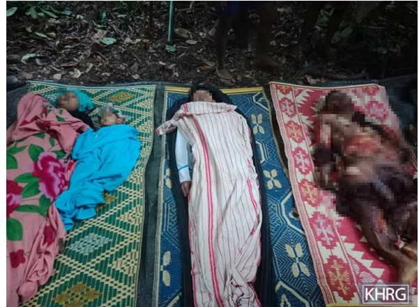
This photo was taken on January 13 th 2023 in Zh--- village, Pay Kay village tract, Lu Thaw Township, Mu Traw District. On January 12 th 2023, four SAC fighter jets conducted an air strike on Zh--- village. The fighter jets dropped eight bombs, and six of them fell onto Zh--- village. The other two bombs fell beside the village. Five villagers, including a 3-year-old infant, were killed, and two villagers were injured. This photo shows four villagers, including the 3-year-old baby, who were killed by the air strike.

Significant evidence points to the SAC repeatedly directing air strikes at civilians or civilian property in the absence of any identifiable link to the conflict, supporting villagers’ views that they are being intentionally targeted. One such case concerns the air strike on Zh--- village, Pay Kay village tract, Lu Thaw Township, Mu Traw District, on January 12 th 2023. On this day, two SAC aircraft dropped eight bombs onto the village and the village surrounding area despite there having been no warnings, no fighting or other military activity in the vicinity before the attack. As a result of the air strike, five villagers were killed, including a 3-year-old girl. Two women were also injured. Two church buildings, one hospital, and two newly-built school buildings were destroyed by the air strike along with multiple houses. Following the air strike, villagers pulled down the damaged houses and community buildings and fled for their safety.