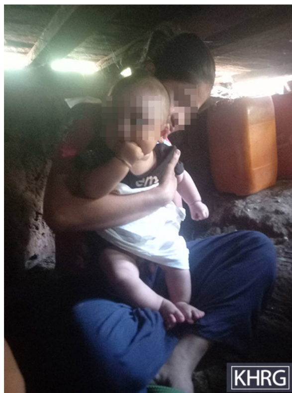
This photo was taken on March 2024 in Vs--- village, Pone Yay village tract, Kaw T'Ree Township, Dooplaya District. On February 23 rd 2024, at around 5:30 pm, the SAC conducted an air strike on Vs-- village, damaging villagers' houses and property. During the attack, villagers from Vs--- village fled to other villages nearby for their safety, and some returned to Vs--- village after the incident. After they returned, an SAC aircraft flew above the village causing villagers to hide in their bunkers. This photo shows a mother and her baby hiding in their bunker after the SAC aircraft was spotted.

Due to the insecurity and uncertainty posed by the risk and threat of air strikes, villagers reported living in a constant state of readiness. Whilst some villagers described preparing food and clothing, others explained that preparedness is often not possible due to the sudden nature of air strikes, with villagers often fleeing in panic without extra clothing or food. In addition, with makeshift bunkers generally serving as the only protective shelter in villages, villagers reported remaining close-to or in-and-out of bunkers, depending on the risk of air. Being in a constant state of readiness increases anxiety and impacts villagers' ability to look beyond their immediate survival needs.