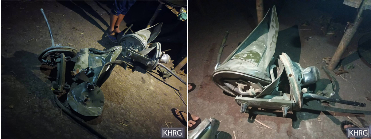
These photos were taken on April 2022 in a place near Lay Kay Kaw area, Pa Lu village tract, Kaw T'Ree Township, Dooplaya District. On April 10 th 2022, fighting broke out between KNLA Cobra Column and the SAC in Lay Kay Kaw Town, and Wg--- village and Wh--- village, P'Loo village tract, Kaw T'Ree Township. SAC military jets conducted air strikes for the whole day in Lay Kay Kaw area, including by dropping two chemical bombs. These photos show the remains of one of the chemical bombs.

after fighting had occurred earlier that day. 52 According to a KNLA official from Battalion #27, Brigade #6, around twenty KNLA soldiers needed urgent medical treatment after they felt dizzy, nauseous, short of breath and had burning eyes, after being in the incident area. A community member who travelled to the area the next day for documentation also experienced burning eyes.