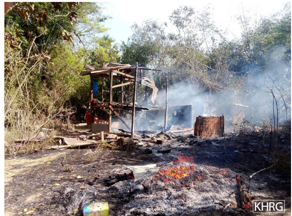
This photo was taken in February 2024 in Wr--- village, Hkay Kyi village tract, Moo Township, Kler Lwee Htoo District. On February 17 th 2024, at around 11 am, SAC LIB #439 conducted a drone attack in Wr--- village by dropping bombs. The photo shows a house that was burned by the air strike.

On another occasion, between 10:40 pm and 11:30 pm on March 23 rd 2024, villagers reported that the SAC dropped a total of 12 bombs (including a cluster bomb and mortar shells) on Wo--- village, Khaw Hpoh Pleh village tract, Bilin Township, Doo Tha Htoo District, damaging or destroying at least 11 houses and four school buildings, and damaging two monastery buildings. There was no fighting or other military activity in the area at the time. Members of KDHW had met in the village two days before the attack. All villagers were sleeping in the village when the air strike happened. Multiple villagers expressed their views, including Naw Bi---, from Wo--- village, who stated: "From my, and villagers', perspective, they aimed to destroy our village and buildings, because there was no fighting that happened [nearby]. [...] They just conducted air strikes intentionally. The village was damaged, and both education and healthcare were affected. The dreams of children were shattered, and the villagers had to flee. This behaviour is absolutely wrong." Naw Bi--- explained that she warned other villages to run into the makeshift bunkers when the attacks started. She also mentioned at least three air strikes on nearby villages, including an air strike conducted on April 29 th 2024 at 11:33 pm on nearby Wk--- village. Daw 56 Bj---, a displaced villager from Wp--- village who saw the incident stated: "They just wanted to target villagers so they conducted the air strike."