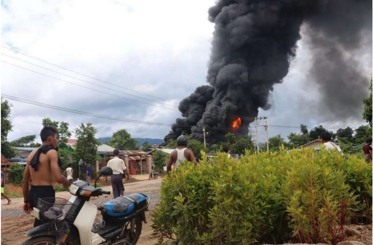
SAC airstrike on petrol storage tank in Kyaung Suu village near Chinese pipelines

From August 12 to 19, SAC continued relentless air and artillery attacks in Hsipaw town and surrounding villages, inflicting further civilian casualties and damaging scores of buildings. Airstrikes on August 14, 15 and 19 damaged buildings in Na Loi and Kyaung Suu villages next to the Chinese pipelines – including a factory petrol storage tank at Kyaung Suu which caught fire only 250 meters from the pipeline control station.