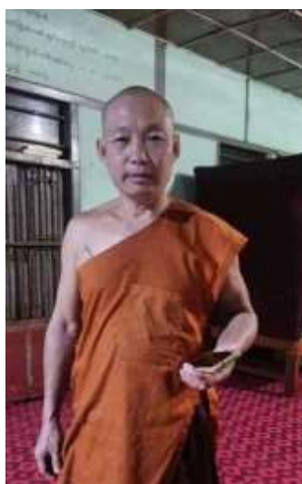
Sao Nandicena killed by SAC airstrike

Nawng Kaw temple, renowned for its scenic lakeside location, is situated about 1 km from the SAC IB 147 base, which had been under attack by the MNDAA since the last week of July.