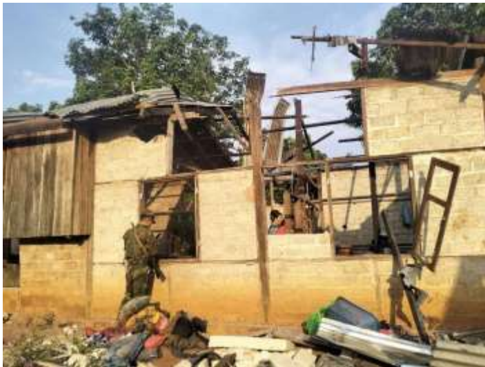
Local villager's house damaged by SAC shell in Thonze village

On May 10, at around 8 pm, SAC troops stationed at Oom Mark Dee village indiscriminately shelled into Thonze village even though there was no fighting. The shell damaged a house, killing a man and a woman aged around 30, and injuring four other villagers.