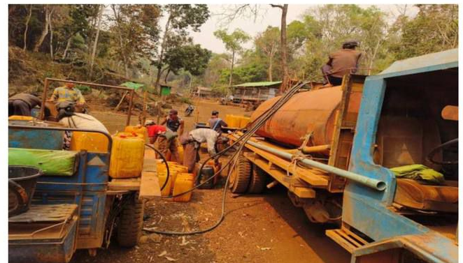
Displaced people collecting water from trucks.

During dry season from March to June, displacement sites in Karenni State and nearby areas suffer from water shortages as many of them are located in dry areas. Water scarcity is a major concern that causes health issues such as seasonal fever, skin diseases, and other health difficulties among displaced population with particular effect on children. It adds to the burden of displaced persons, especially among women, as they have to travel far to fetch water, share limited amount from water donors, or even purchase it.