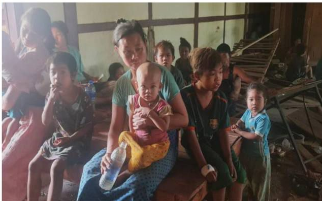
Civilians awaiting evacuation Hpasaung township.

In March, attacks by Myanmar military junta including the use of airstrikes in Hpasaung in Karenni State, and Phekhon and Pinlaung townships in Shan State worsened displacement of Karenni population. The attacks on Hpasaung forced over 1,000 civilians to flee. Over 10,000 people, including 3,000 Karenni, were displaced after the military junta attacked civilian areas in Phekhon and Pinlaung townships of Shan State.