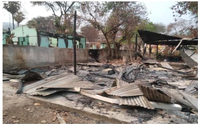
Homes destroyed by Myanmar military junta's troops.

In the past two months, over 100 civilian homes in Hpasaung and 48 in Shadaw were destroyed by the military junta's airstrikes, artillery attacks, and arsons. In addition, 129 buildings, including churches and barns, in Moebye and eastern Loikaw that were abandoned due to Myanmar military's attack in the past three years, were burned down by wild fires.