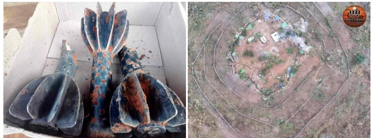
SAC artillery shells, Loikaw township

On December 25, Christmas Day alone, the SAC fired heavy artillery and carried out over 30 airstrikes, including 500lb bombs, on Loikaw city. Additionally, in the evening, SAC troops carried out aerial bombing four times with two fighter jets at Khaung Mine village, Pekhon township. On the same day, a frontline SAC outpost near the Thai-Burma border, BP-12, Hway Ka Mauk military camp, was seized by the KA, resulting in the capture of some ammunition.