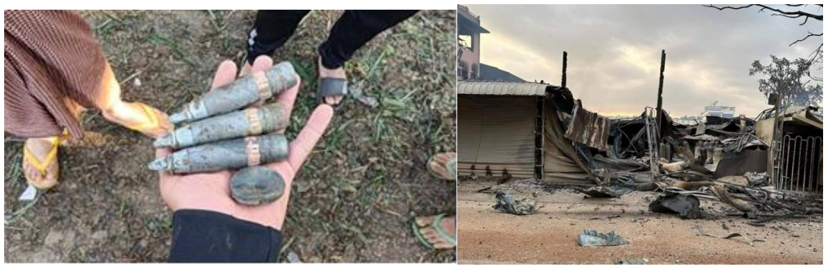
SAC aerial bombs, west Demawso township Building damaged by SAC shells in Loikaw town

On the morning of December 12, intense fighting erupted between the SAC army and combined resistance forces in Loikaw town. SAC Battalion 54 relentlessly fired heavy artillery at Daw U Khu village and Naung Yar village. By 11 pm, the Golden Loikaw Welfare Association office in Loikaw, along with seven ambulances and nearby houses, was set ablaze due to the SAC's heavy artillery fire. Residents fleeing the conflict from Minelon Ward in Loikaw returned briefly to retrieve essential belongings, resulting in two fatalities and one injury from SAC shelling.