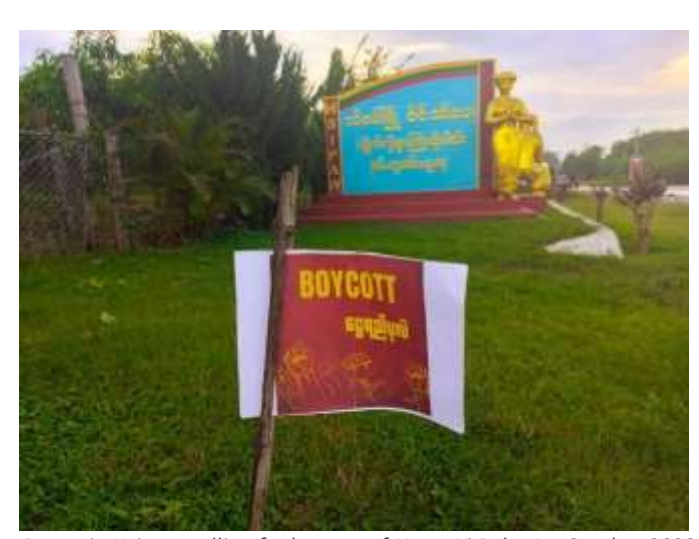
Poster in Hsipaw calling for boycott of Ngwe Yi Pale, 1st October 2023