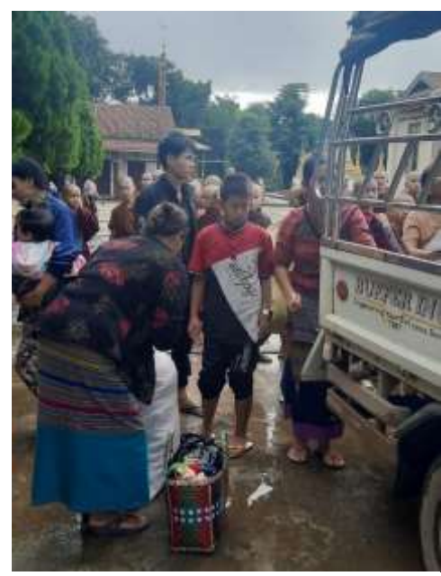
IDPs fleeing to Namma temple

On November 21 and 22, a renewed attack by MNDAA in Nam Pawng led to indiscriminate artillery fire by SAC LIB 291 around the village, causing about 80 residents to flee again to Nam Ma to shelter with their relatives.