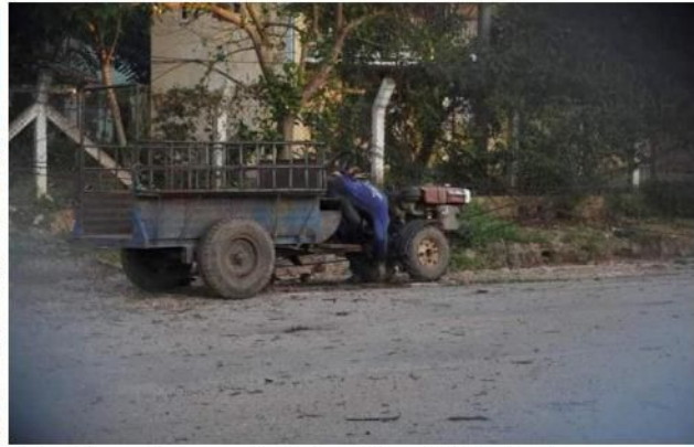
Civilian driver shot dead by SAC, Loikaw town

On November 29, SAC's aerial bombing of Loikaw town was particularly intense, with around 60 bombs dropped throughout the day, including 500 lb bombs. As a consequence, numerous civilian houses were destroyed.