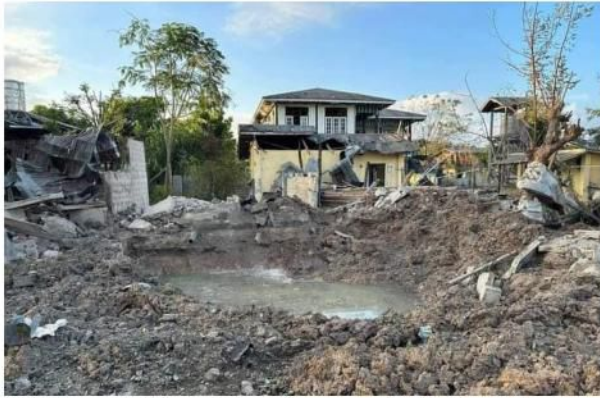
SAC aerial bombing damage in Loikaw town