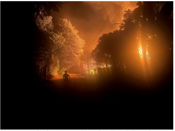
Houses set on fire by SAC airstrikes and artillery shells, Loikaw town

On November 15, the SAC initiated heavy artillery fire towards the Daw Noe Ku IDP camp located near the Thai-Burma border. This attack forced more than 1,000 IDPs to flee across the border, seeking refuge near the No. 1 refugee camp in Thailand. Meanwhile, SAC artillery fire near Loikaw town led to the deaths of a mother and son, while another child suffered injuries. Additionally, on the east side of Loikaw, a displaced person from Nam Kut lost their life due to intense SAC shelling. Further consequences of the SAC's heavy artillery fire included the destruction of a Buddhist monastery in Daw U Khu ward, and the death of an eight-year-old boy in Myaynigon in Loikaw town.