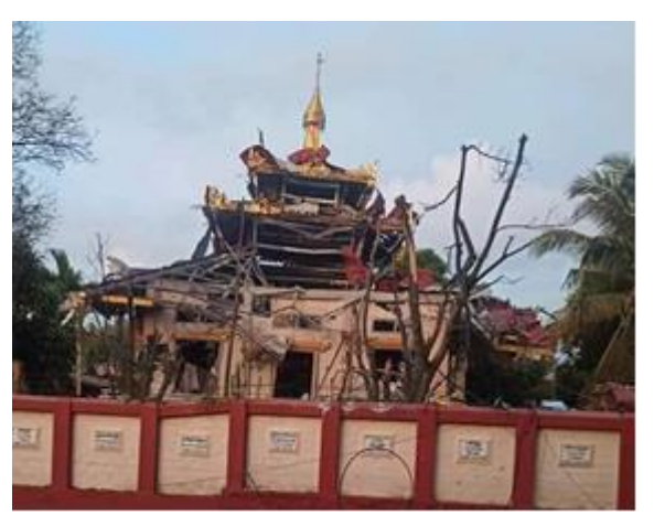
A Buddhist temple damaged by SAC shelling, Loikaw town

On November 14, within a single day, a total of 19 civilians were killed, and seven others were injured in Karenni State. Nine civilians were killed by artillery shells, six shot on sight and four killed by airstrikes.