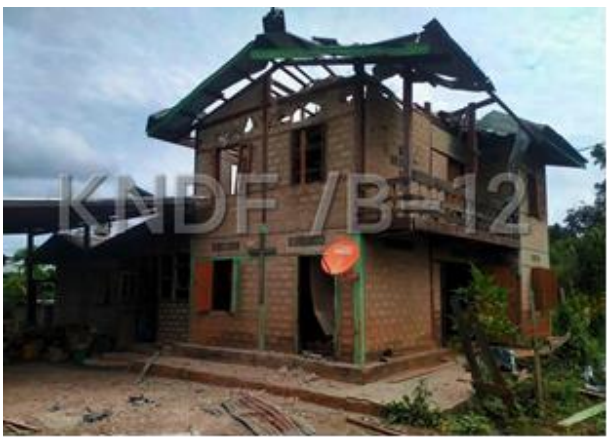
House damaged by SAC shelling, Loikaw township

On October 31, two women returning home from an IDP camp in Pruso township to collect some property, were injured in the stomach, legs and hands by indiscriminate SAC shelling. That morning, there had been clashes between the combined Karenni forces and SAC troops near the area.