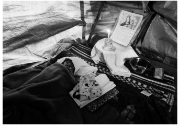
A seven-day-old baby who died after SAC shelling

On October 19, a 30-year-old man in Loikaw who had been arrested and beaten by SAC troops of IB 72 on October 3, 2023, died of his injuries in Mandalay hospital.