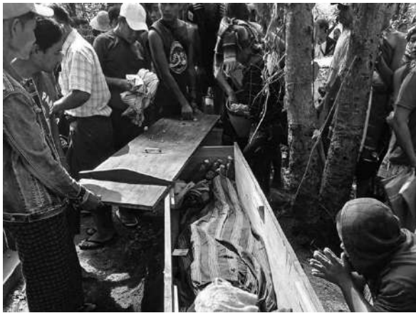
A villager who died from SAC torture

On October 15, at 7 pm, the SAC fired seven mortar shells into IDP areas in western Demawso township, damaging some IDP shelters.