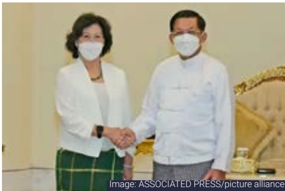
Former UN Special Envoy to Myanmar, Noeleen Heyzer, with the junta leader, Senior General Min Aung Hlaing, in Naypyitaw in August 2022.

Before her resignation, the Special Envoy undertook official visits to Beijing and New Delhi to promote greater regional unity in response to the crisis and called for the establishment of an Inclusive Humanitarian Forum (IHF). 200 In remarks to the General Assembly in March 2023, the Special Envoy explained that the Forum could comprise a core group of UN member States, notably Myanmar's neighbouring countries and other regional actors, to engage inclusively in seeking a comprehensive assessment of ground realities and identify ways to overcome obstacles for humanitarian actors to more effectively reach those in need. 201 She added that her work on the IHF to date had already proven to be an important vehicle driving constructive discussions and building greater solidarity and coherence between local actors. 202 The initiative was met with resistance, however. The Special Envoy's subsequent resignation underlines the lack of a comprehensive and coherent system-wide UN strategy on Myanmar.