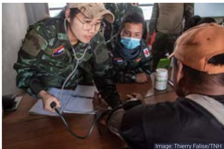
A female medic from the Free Burma Rangers relief group examines a man in a displacement camp in Karenni state.

Although there has been some collaboration between UN agencies and local actors to reach remote IDPs, 129 civil society groups have urged the UN to find more effective ways to partner with local organisations to deliver lifesaving humanitarian relief at scale. Since mid-2022, the NUG, KNPP and KNU have jointly called on the UN to coordinate with them directly to deliver assistance to people in the east and southeast. 130