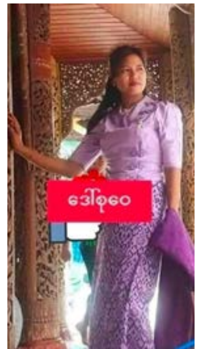
Photo: According to local residents, at 7PM on 20 June, four women between the ages of 40 and 50 were arrested by the Mawrawaddy Navy of the junta council in Phaung Taw village, Kanbauk area, Yehyu Township.