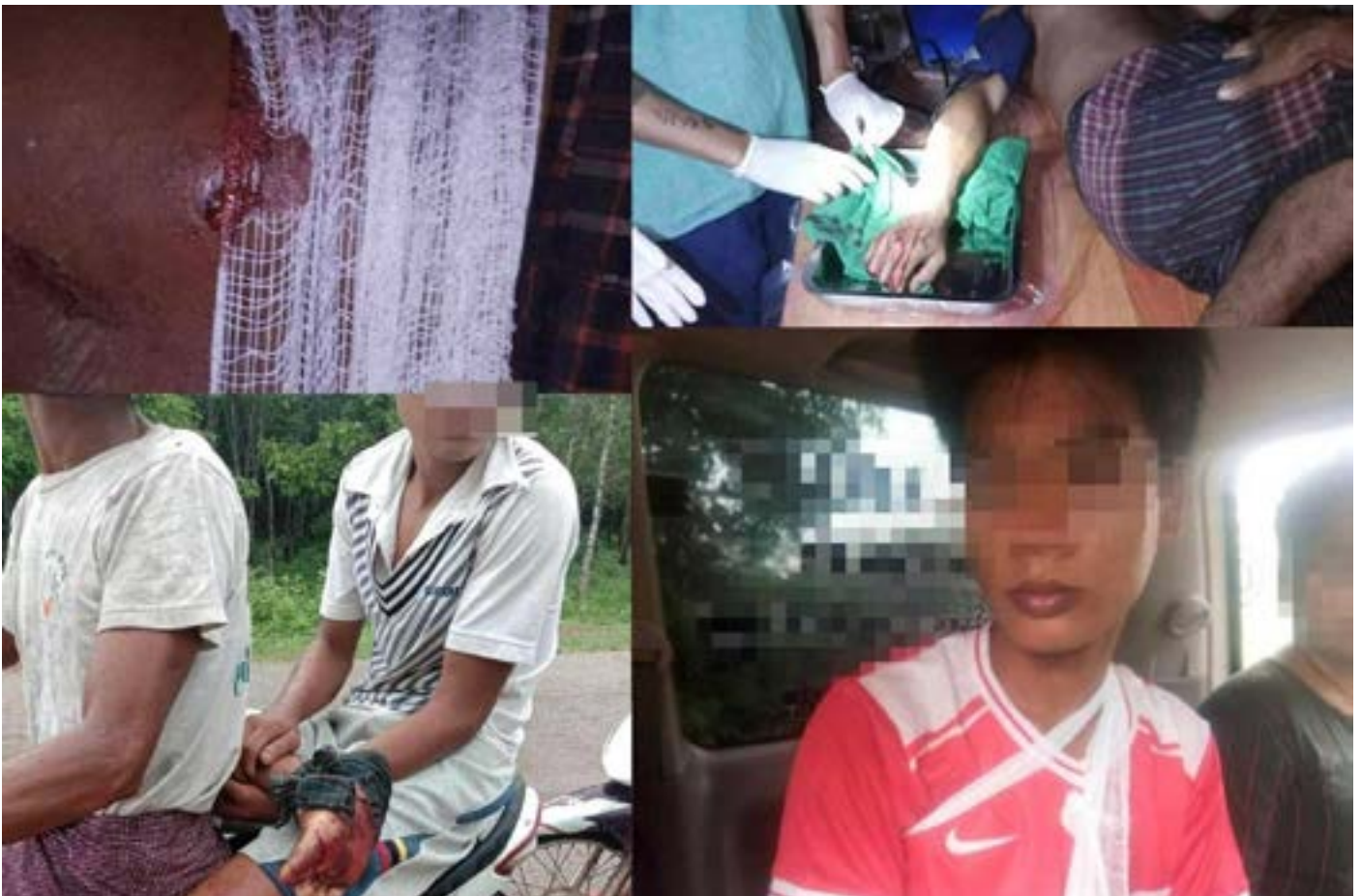
Photo: On June 19, 2023, the Junta Force's Artillery Regiment Command No.318, based in Abit village in Mudon Township fired a series of mortar shells of 120 mm into Thakun Taing village, Win Ray Township, injuring at least three villagers at 6:20 PM.

Civilians have been forced to endure widespread violence deployed systematically against them by the Burma Army. The junta is desperate for power and legitimization. In response to growing disdain, everyone has become a target. The regime's operations, particularly their increased presence in areas where opposition forces are stronger, have resulted in the burning of villages, indiscriminate firing, torture, abductions, arbitrary arrests, forced portering, and more.