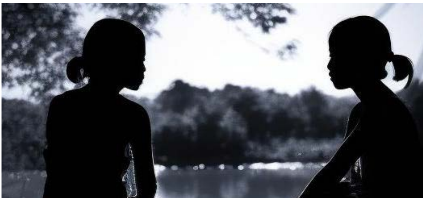
Photo: Mon women's groups are warning of an increase in child sexual abuse incidents in villages across Mon State with no action being taken by the authorities.

declared. The junta has arrested CDM school teachers, civil servants from different departments, and former ward administrators.