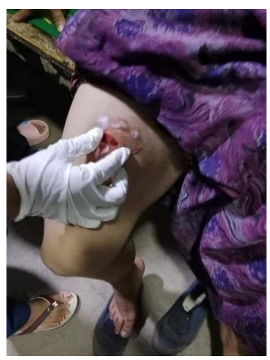
Woman injured by SAC shelling

On September 17, fighting broke out between SAC and TNLA troops south of Wein Nang village, at the southern edge of Muse town.