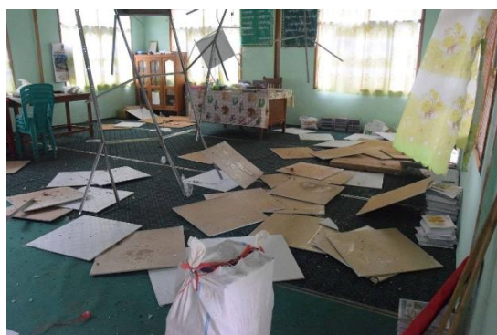
School damaged by SAC airstrikes

On August 22, SAC troops patrolling in Ta Nee Hla Le village, Demawso township, torched a civilian house despite there being no clashes at the time.