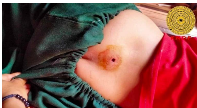
Child injured by SAC drone attack

On August 23, over a hundred SAC troops from LIB 519 and LIB 334 bringing supplies from Shan State clashed with the Karenni Army in Mae Hla Yu, Hso Ta Shar (Shadaw) township, east of the Salween river. 15 SAC soldiers were killed, 30 injured and the KA seized a large amount of ammunition. After the clash, the SAC launched airstrikes over the area. On the same day, SAC troops from Military Training Camp no.14 attacked a village in eastern Pruso township using a drone, injuring three boys, aged 8 years, 9 years and 10 years. Moreover, a SAC aerial bomb damaged a bridge near Kwai Nga watershed in Demawso township, where IDPs from Demawso were taking shelter.