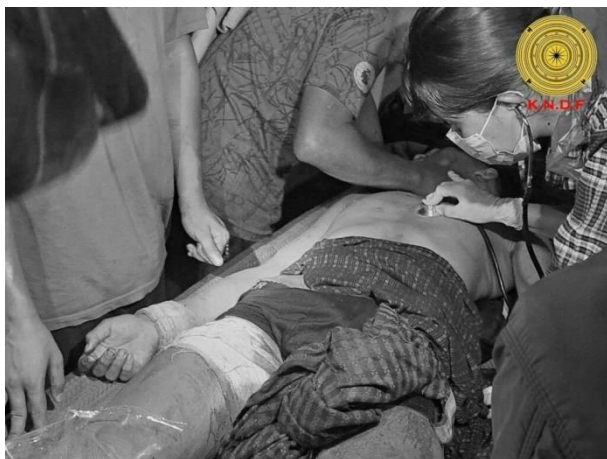
Civilian injured in Pada Nye village, Loikaw township

On July 20, SAC troops patrolling from Moebye to Loikaw clashed with combined Karenni forces in Pada Nye village, Loikaw township. During the clash, SAC troops used some civilians as human shields and SAC's Loikaw-based LIB 356 indiscriminately fired artillery shells into Pada Nye village, killing a 16-year-old boy, and injuring a woman and a man. On the same day, SAC troops indiscriminately shelled Khone Tar village in Loikaw township, injuring a child and a man.