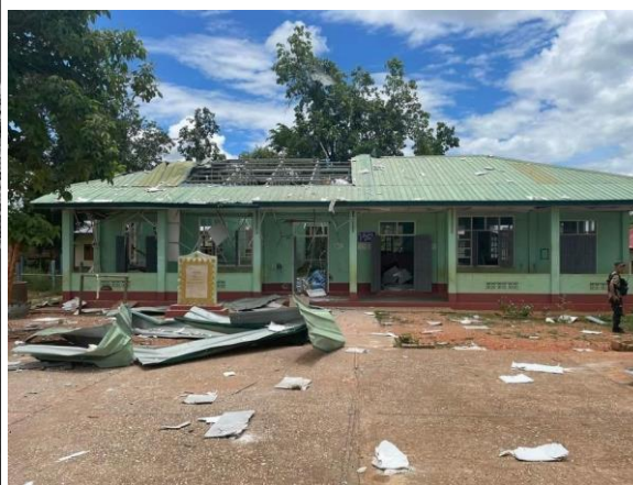
School damaged by SAC airstrikes, Kyot Su village, Mese township

On July 21, about 300 SAC troops patrolling into Kyotpan Nyo and Wan Aw villages east of the Salween river in Pasaung township, clashed with combined Karenni forces. During the clash, SAC sent fighter jets to drop bombs and fired artillery from Pasaung; SAC troops then torched more than 20 houses in Wan Aw village.