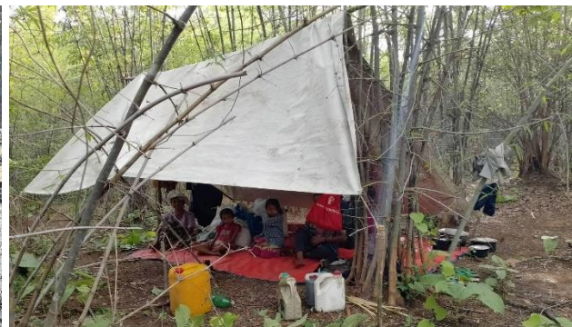
New IDPs in Ywathit sub-township

On June 24, eighteen SAC soldiers from Nam Paw outpost in Mese township near BP 13 on the Thai-Burma border, surrendered with their arms to combined Karenni forces. On the same day, the dead body of a civilian was found at Nam Kit village in Pasaung township by the Free Burma Rangers aid group.