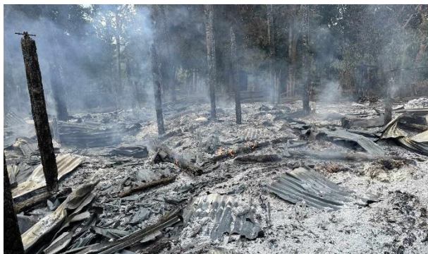
SAC bombing of Nam Kit village, Pasaung township

On June 23, at 4 am, SAC aircraft bombed Do Raw village in western Pruso township, killing a 52-year-old man, injuring two children under five years old and their mom, and damaging a church and four houses. On the same day, at 5 pm, combined Karenni forces occupied a SAC outpost east of Mese town. After the clash, four SAC fighter jets bombed the area.