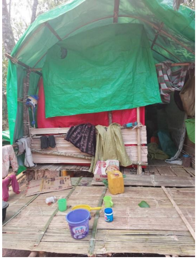
One of the many IDP shelters in Karenni state.

At the moment, a few families who had to flee from the war have opened up shops to support their livelihoods. The WWF has also supported married couples by providing each of them with a pig to raise as livestock, and a budget to do so. Even though some families wanted to continue upland farming, there is no longer enough land for all of them to farm. A few families are able to farm, but only about 1 out of 5 households can properly farm upland. Most holdholds are facing a shortage of rice, oil, and drinking water to sustain themselves. Instead, families are having to borrow or buy food and water from others who still have it.