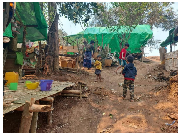
Karenni IDPs in the camps.

reopen, there were some donors who provided supplies but there have not been any donations this month. Schools are mainly in need of teaching materials. Students currently do not have enough textbooks, making it difficult for them to learn.