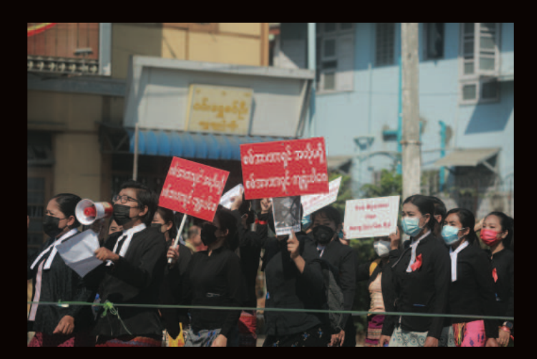
Lawyers in Myanmar protesting the military coup in Mandalay, February 15, 2021.

Human Rights Watch calls for the junta to urgently restore civilian, democratic rule and to drop all criminal charges against people for exercising their fundamental rights. Foreign governments and international bodies should increase pressure on the junta through coordinated targeted sanctions against perpetrators of abuses and call on the United Nations Security Council to pass resolutions imposing a global arms embargo and sanctions on military leaders responsible for abuses, and referring Myanmar to the International Criminal Court.