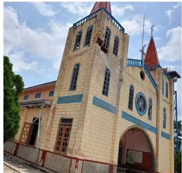
A religious building damaged by SAC shelling, Moebye

On June 10, there were heavy clashes between combined Karenni forces and SAC troops in Kaung Ei village, Phekon township, leaving two Karenni troops dead. At 7 pm, indiscriminate shelling by the SAC into an IDP area in western Demawso township damaged a house.