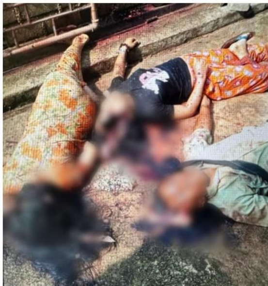
Civilians killed by SAC troops, Moebye town

On June 8, at 4 pm, a SAC tactical battalion based in Bawlake town fired artillery shells at Le Won village, Sawlo village tract, killing a 29-year-old man and damaging a house. On the same day, at 7 pm, SAC LIB 530 fired five artillery shells into Htee Se Khan village, Loi Len Lay sub-township of Loikaw township, injuring a man, damaging a construction store and igniting its contents including thirteen million kyat in cash.