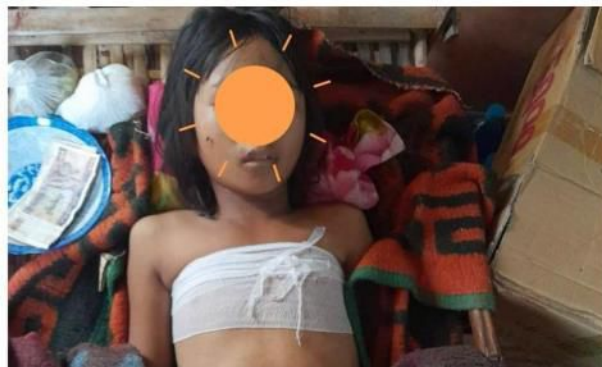
A girl injured by SAC shelling, Loikaw township

On May 29, at 10 am, a vehicle driving on the road between Pasaung and Bawlake was shot at, killing a 30-year-old woman and injuring a man in the car. On the same day, at 9 pm, SAC troops fired 20 mortar shells indiscriminately from Moebye-based LIB 422 into Sekan quarter, Moebye town, killing an 11-year-old girl and injuring four civilians.