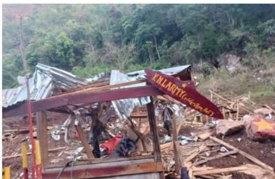
KNLA security gate destroyed by SAC airstrikes, Pekhon township

On May 28, at 4:30 am, a SAC fighter jet bombed an IDP camp two times in western Moebye township, injuring four civilians and damaging three houses. Moreover, at 8 pm, a SAC artillery shell exploded in Koemiko village, Loi Lay Lay town, injuring a seven-year-old child in the right hand and another nine-year-old child in the head and chest.