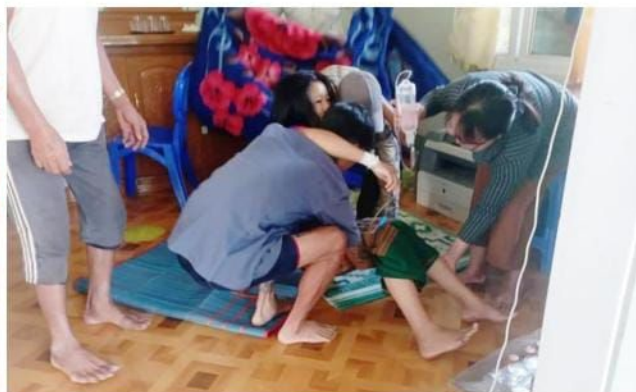
Woman injured by SAC shelling in Moebye

On May 18, at 3 am, the SAC bombed with 500 pound bombs in Dawlawkhu village and Pehlyar village, Demawso township, damaging five houses in Dawlyarkhu and a school in Pehlyar village. On the same day, at 11 am, SAC troops in 10 vehicles indiscriminately shot civilians on sight while passing through Moebye township, injuring three people. Moreover, at 12 noon, indiscriminate artillery shelling by SAC in Moebye town, injured a 41-year-old man in his left arm, hands, waist and thighs.