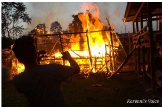
Damage from SAC jet bombing, eastern Demawso

On May 17, at 4 am, the SAC launched an airstrike on Sawlo village, Bawlake township, despite there being no clashes at the time. The bombs killed a 17-year-old girl, injured four men and damaged two medical buildings, six houses and a temple. On the same day, the SAC bombed three villages in Htee Phoe Kaloe village tract, Demawso township, including with 500 pound bombs, which damaged nine houses, a school and three barns.