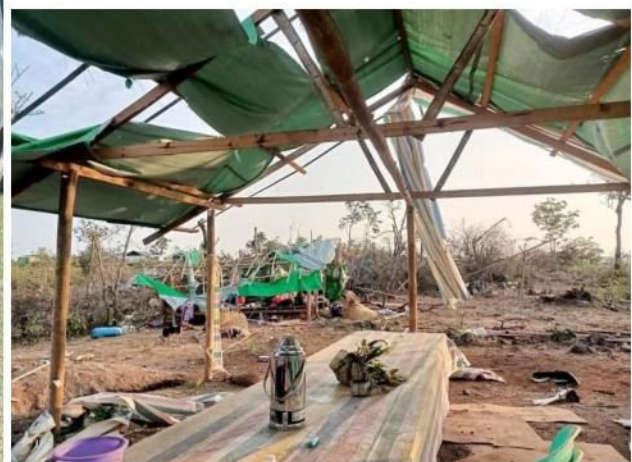
IDP shelters damaged by SAC fighter jets in western Demawso

On May 2, at 8:30 am, three villagers were shot at by SAC troops while going back home to collect their possessions in Daw Nye Khu village, Demawso township, but fortunately no one was injured.