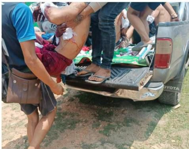
Villagers injured by SAC shelling, Pekhon township

On May 1, at 4:50 am, Pasaung PDF and Bawlake PDF launched an attack on a SAC outpost in Bawlake town, killing 7 SAC soldiers and injuring at least 13 others. Two Bawlake PDF soldiers were killed in the clash.