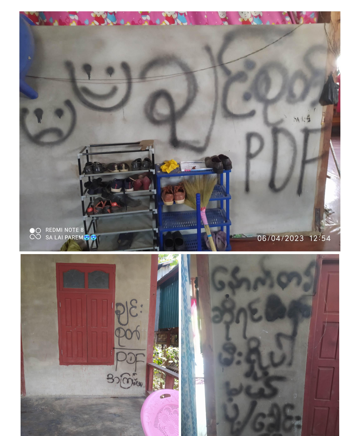
Figure 6: Handwritten text on walls alleged to be from Pyin Taw U village are abusive towards Chin people and PDFs, as well as making threats. (Top image) "Stupid Chin, PDF", (bottom left) "Stupid Chin, PDF terrorist" and (bottom right) "will burn down next time, from the leader".