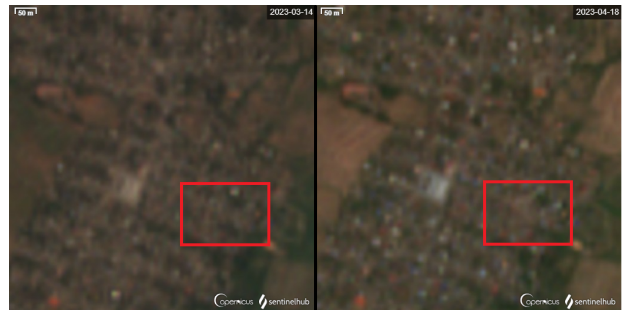
Figure 7: <u>Sentinel</u> footage demonstrates that the layout of the village- highlighted in red - differs greatly with discoloration and lesser definition to the area between 14 March 2023 and 18 April 2023.

This Sentinel imagery, together with the ground footage geolocated by Myanmar Witness, narrows down the timeframe of these events occurring between 14 March 2023 and 8 April 2023.