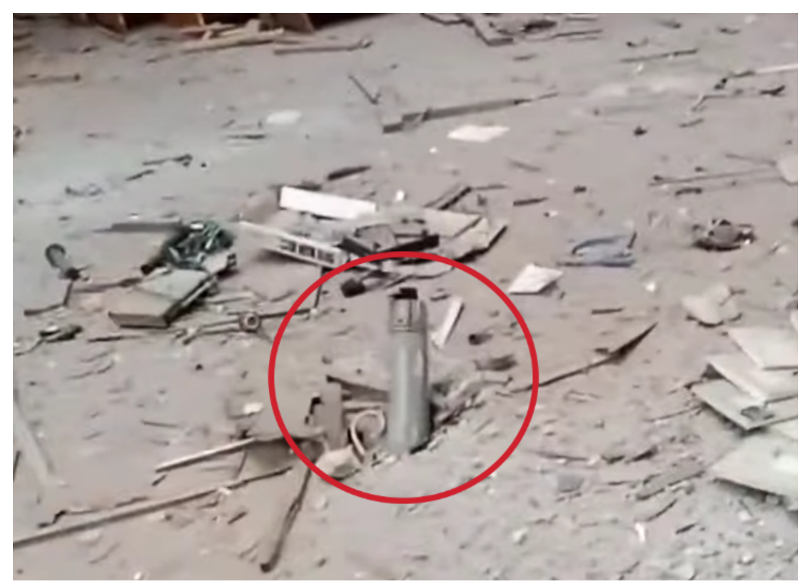
Figure 10: A piece of ammunition filmed inside of Pyin Taw U village, next to Shiloh Baptist Church.