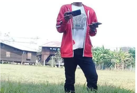
Figure 8: Image of a deceased individual, uploaded on 6 April 2023, alleged to have been killed in the airstrike. This is compared to an image taken from a Facebook page sharing a missing persons advertisement on 6 April 2023.