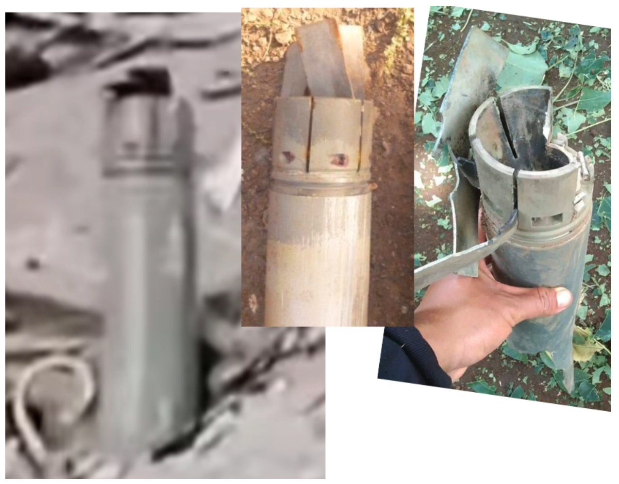
Figure 11: Visual comparison of remnants from Shiloh Baptist Church to confirmed S-8-type rockets' fins sections. (Sources: Private; <u>Guns.allzip</u>; <u>KNU</u>).