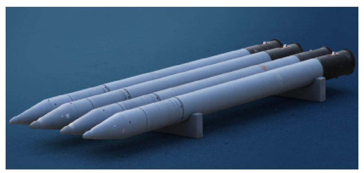
Figure 12: One of the S-8 rocket variants (the S-8KOM) as marketed on the website of one of its current exporters. The S-8-type is today manufactured by many companies internationally. (Source: Roe.ru).

The S-8 type rocket (of which several variants exist) can be employed by several aircraft in use within the MAF. It is electrically fired by several models of rocket pods which are mounted on underwing pylons.