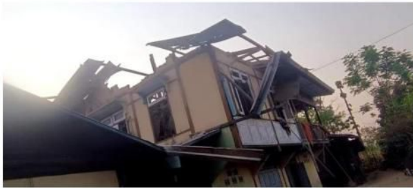
SAC aerial bombardment in eastern Moebye, Pehkon township

On April 2, at 7 am, SAC indiscriminately fired artillery shells into eastern Pehkon township, killing a 50-year-old man, injuring five civilians, and damaging a church and some houses.