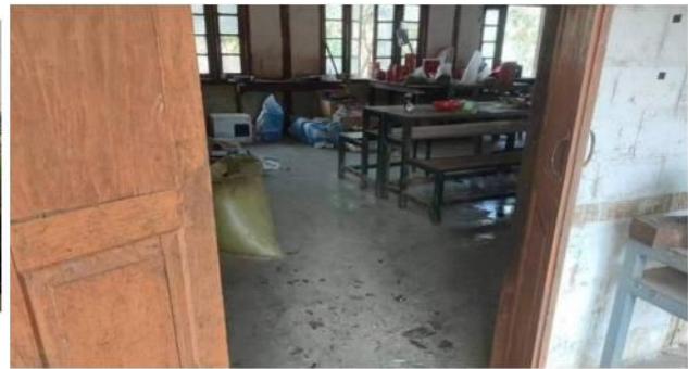
High school building damaged by SAC airstrike, Demawso township

On April 4, a SAC aircraft dropped a 500 pound bomb on Taungsaloe village, Pehkon township, Southern Shan state, damaging some houses. On the same day, combined Karenni forces and SAC troops clashed in Taneelar Le village, Demawso township; 10 SAC soldiers were killed and ammunition seized by the Karenni forces, while one KNDF Battalion 6 soldier was killed. At 3 pm, a SAC fighter jet dropped six bombs in eastern Demawso township, causing some IDP tents to catch fire.