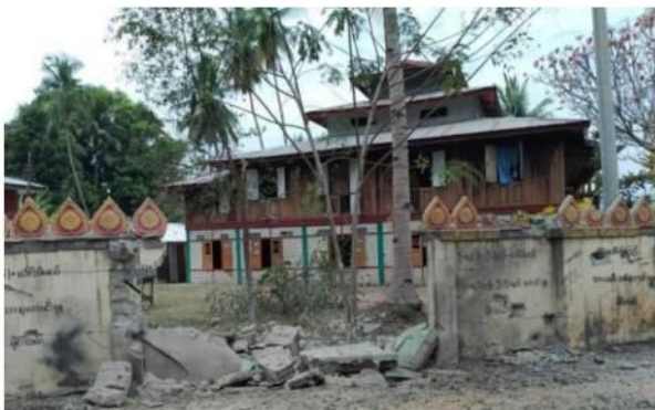
Temple damaged by SAC shelling in Yay Ni Pot village, Bawlake township

From March 20 to 23, several columns of SAC troops including from IB 12, LIB 515 and LIB 516 under Military Operations Command 2 in Central Shan State advancing into Dawtama Gyi village, Demawso township, clashed with KA, KNDF, Naypyidaw PDF and Bawlake PDF forces; 90 SAC soldiers were killed, including a major, and 50 injured. The Karenni combined forces also seized a lot of ammunition. Two KNDF, two KA, and one Naypyidaw PDF soldier were killed. During this time, the SAC troops torched 100 civilian houses in Dawtama Gyi village tract. On March 23, after suffering heavy casualties, SAC aircraft dropped six bombs in eastern Demawso township. On the same day, at 3 pm, SAC carried out an airstrike on timber workers near Wabla village, Bawlake township, killing three civilians and injuring five.