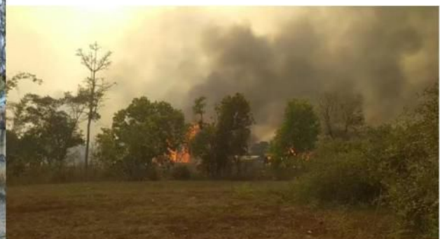
Torching houses in Dawtama Gyi village tract, Demawso township