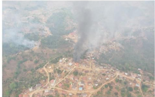
Houses burnt down by SAC in Pinlaung township

On March 12, the SAC indiscriminately fired artillery shells in Pruso township, despite there being no clashes at the time, injuring a 30-year-old woman and damaging three houses. Troops of SAC ID 66 patrolled into an IDP camp at the Shan-Karenni border, eastern Mobyie township, after which two burned corpses were found -- an 81-year-old woman and a 78-year-old man -- as well as the body of a grade 7 student who had been shot dead. On the same day, SAC troops burnt down 30 houses in Daw Ngay Khu village after clashing with combined Karenni forces in Day Ngay Khu village, Dawtamagyi village tract, Demawso township,