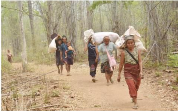
Villagers fleeing a SAC patrol in Demawso township

township. 19 SAC soldiers were killed and 6 SAC soldiers arrested; some ammunition was also seized. At 4 pm, the SAC attacked an outpost of KA battalion no. 3 near the Thai-Burma border. The attack was repelled, after which the bodies of 2 SAC soldiers were found. On the same day, at 5 pm, the SAC launched three airstrikes on Daw Seh village, Dawklawdu village tract, Demawso township. Also on the same day, at 4 pm, SAC troops raided Nam Nay village in Pinlaung township, killing 30 civilians and 3 monks, and burned down 50 houses.