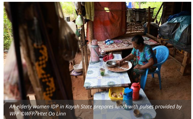
An elderly women IDP in Kayah State prepares lunch with pulses provided by WFP

A group of children attending a nutrition and hygiene awareness session conducted by WFP in Maungdaw Township, Rakhine State.