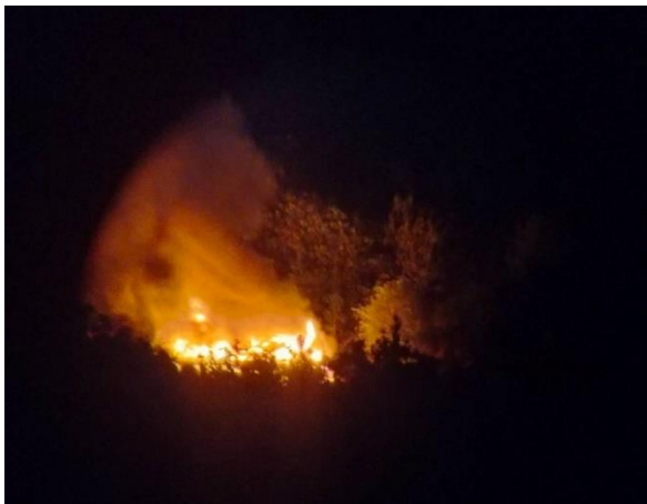
House torched by SAC, Nan Paw Lo village

On June 25, from 6 am to 2:30 pm there were heavy clashes between combined forces of KA, KNDF, Loikaw PDF, DMO PDF, KRU, Middle Special Force and SAC troops based in Daw Nga Kar quarter, Kone Thar village and Thay Hsu Leh village, Demawso town. During the fighting, 3 soldiers from the resistance forces suffered minor injuries. SAC casualties are unknown.