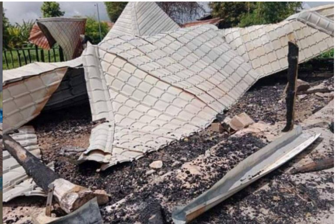
House burned by SAC troops in Hsawng Nam Kay village

On June 21, SAC troops camped in Nam Maw Long village looted a motorcycle, fertilizer, and ploughing machine from the village, and torched three houses.