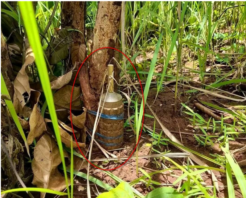
Landmine laid by SAC troops at the foot of Loi Mong Ku hill

On June 22, at around 6 pm, the SAC troops set fire to two houses in Loi Pao village.