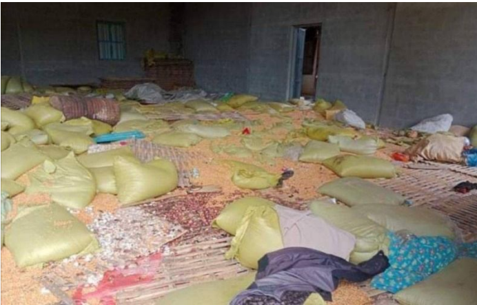
House ransacked by SAC troops in Loi Pao village

On June 3, the SAC troops went to Hla Hei village and set fire to over 20 houses. During this time, SAC troops also torched several houses in Koong Mark Lang village.