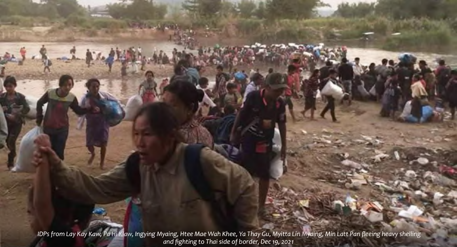
IDPs from Lay Kay Kaw, Pa Hi Klaw, Ingying Myaing, Htee Mae Wah Khee, Ya Thay Gu, Myitta Lin Myaing, Min Latt Pan fleeing heavy shelling and fighting to Thai side of border, Dec 19, 2021