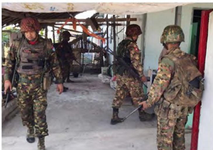
House-to-house searches by SAC in Lay Kay Kaw before fighting erupted