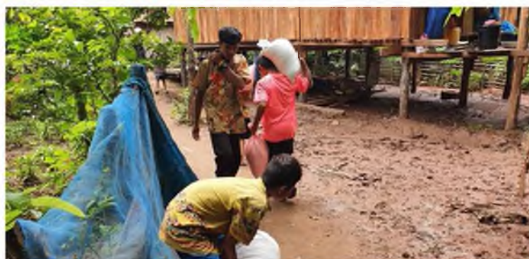
KERT/KCBOs responding to emergency needs of IDPs fleeing airstrikes, heavy shelling by Burma Army in U Kray Hta and Ler Khaw, Dooplaya District