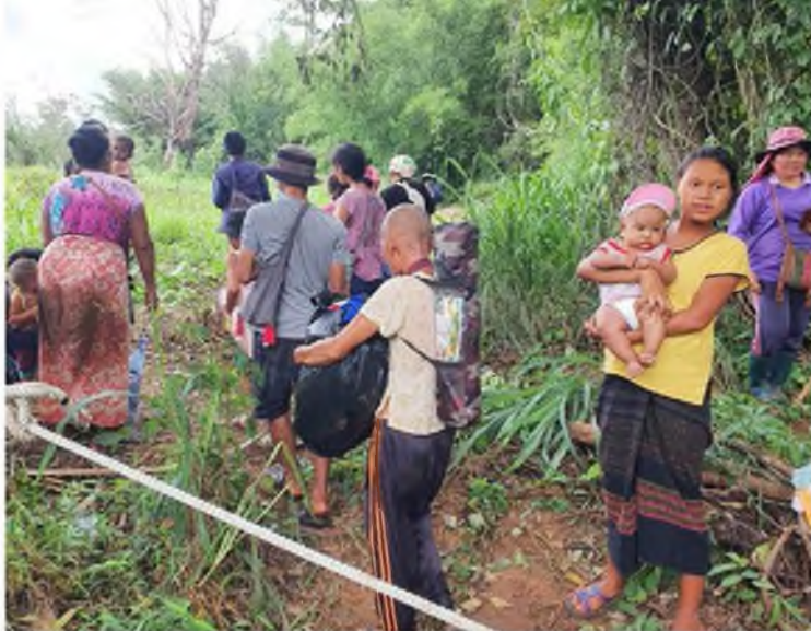
IDPs from U Kray Hta village fleeing fighting, Waw Lay area, south of Myawaddy, Dooplaya District, June 26, 2022