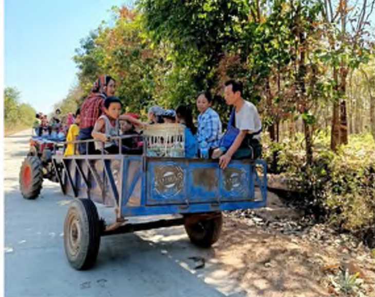
IDPs in Kawkareik Township fleeing heavy artillery shelling by Burma Army on Jan 8, 2022

There have been two patterns of displacement in Dooplaya. East of the Dawna Range, displaced villagers have fled to the Thai border, where some have crossed into Thailand, but most have gathered in makeshift IDP camps just inside Karen State. West of the Dawna Range, IDPs have mostly fled to shelter in surrounding villages, and have not set up camps.