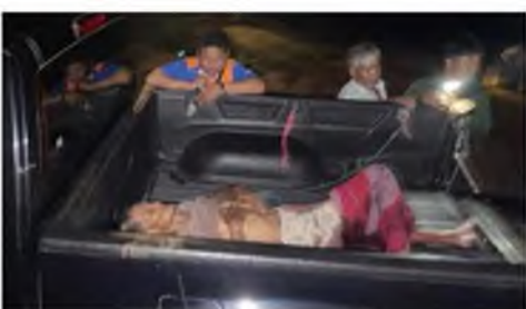
Villager injured by SAC airstrike in Thay Baw Boe, July 1, 2022