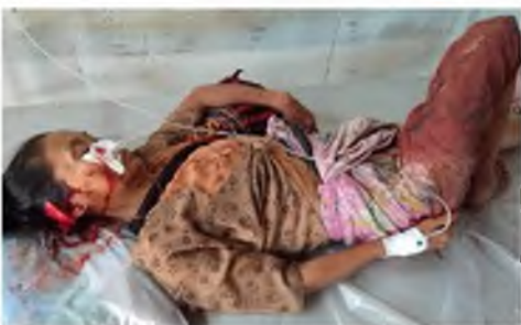
Villagers injured by SAC shelling in Myut Haung, Jan 8, 2022