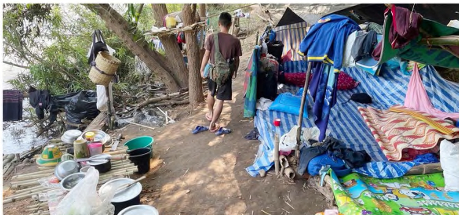
IDP site on riverbank at Thay Baw Boe village, south of Myawaddy, Dooplaya District, January 2022