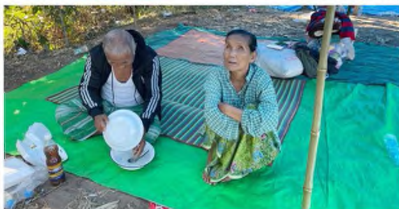
IDPs at Plaw Ter Pyo IDP site, Pa Lu Poe, south of Myawaddy, Dooplaya District.