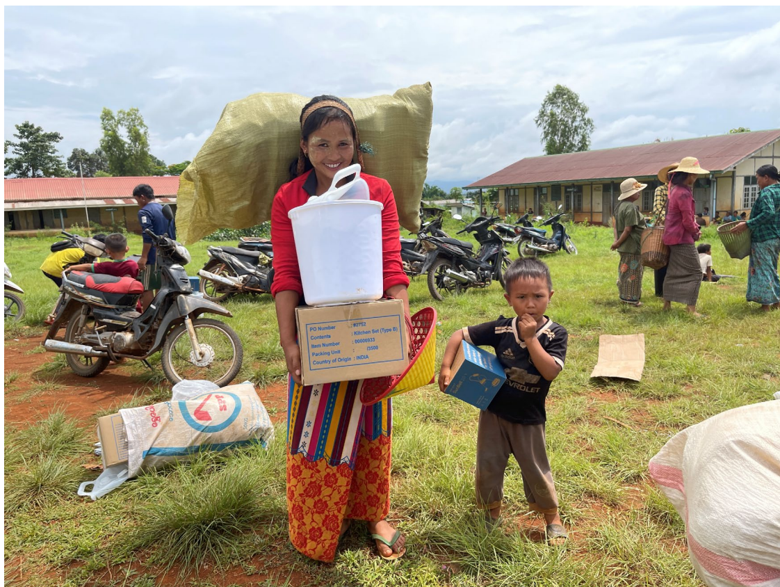
UNHCR and its partners are providing relief items to internally displaced and host community families in Kayah State, Myanmar

There was an uptick in cross-border movement in June following armed clashes in the north-west regions of Myanmar. Floods in the neighbouring state of Assam – where relief goods are procured and transported – also hampered aid distribution by local community-based organizations. With the start of the monsoon season in June, there is an urgent need for semi-permanent shelters in Mizoram and Manipur. Other needs across various new arrival settlements include WASH, food, health, NFIs and livelihood assistance.