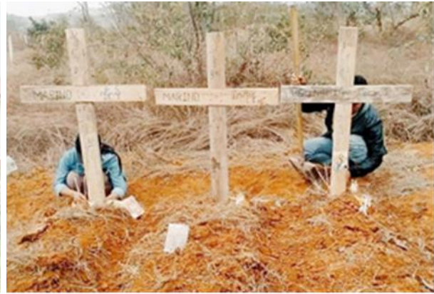
3 civilians were killed in Daw U Khu quarter, Loikaw Town

On March 25, combined troops of KA, KNDF B-09, KNDF B-19, and PDF (D) battalion clashed with SAC troops 2 times while SAC was carrying out an offensive at San Pya 6 Mile in Demawso township. One clash occurred at 10 am along the road in Bheh Ta Lein villag, 6 Mile village tract, Demawso town; and another at 4 pm along the road from Pan Kan and Daw Poe Si.