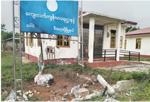
SAC shelling damaged a clinic building in Daw She village