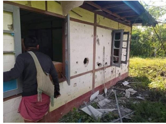
Shwe Pyi Aye clinic, damaged by SAC shells

On November 1, combined KA and KNDF troops clashed with SAC troops camped at Htu Lwi Belar village, Demawso township, killing 8 SAC soldiers. One KNDF soldier was injured.