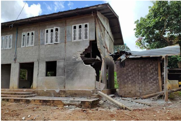
Buildings in Pekhon damaged by SAC shells