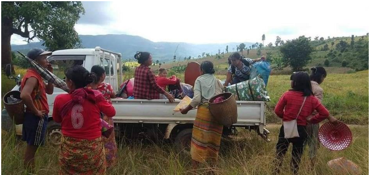
Villagers fleeing from SAC clearance operations while harvesting in western Pekhon

On November 2, at 2 pm, the KA, KNDF, Pekhon PDF and Moe Bye PDF clashed with SAC troops while they were carrying out clearance operations in western Pekhon township. Five SAC soldiers were killed and 2 PDF soldiers injured. These clearance operations, being carried out by about 500 SAC soldiers, caused the villagers of Loi Lon and Loi Hweh villages, who were in the middle of harvesting their rice fields, to flee to nearby jungle.