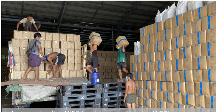
Labourers loading WFP food commodities for WFP's emergency response in Mindat, Chin State.