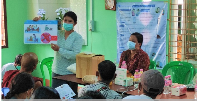
WFP nutrition team delivering nutrition awareness sessions to its beneficiaries in Kayan Township, Yangon peri-urban areas.