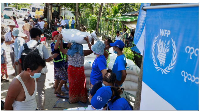
A scene from a busy food distribution point in Hlaing Thar Yar Township, Yangon peri-urban areas.