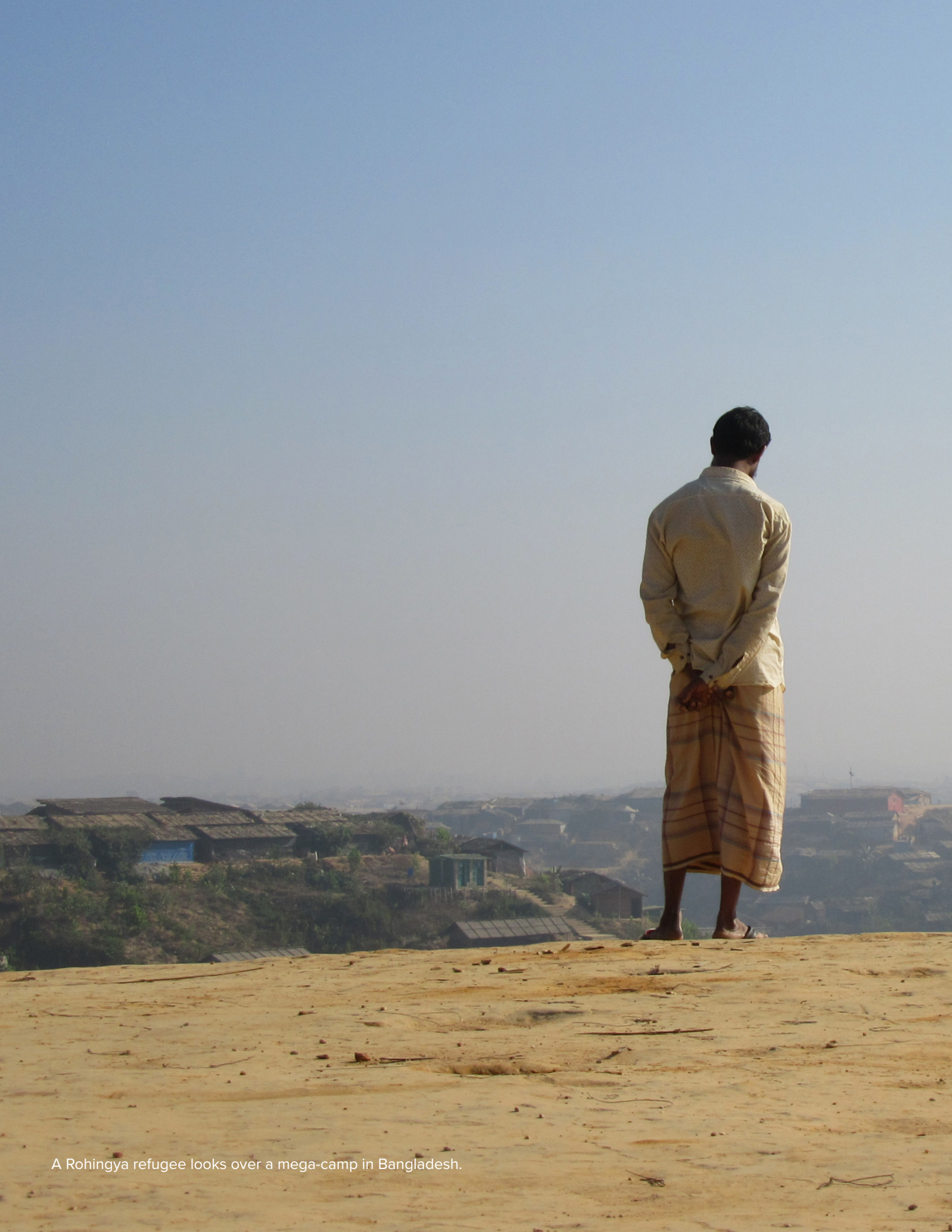
A Rohingya refugee looks over a mega-camp in Bangladesh.