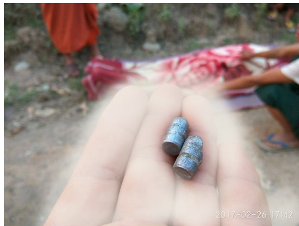
Bullets that hit Lung Jarm Phe