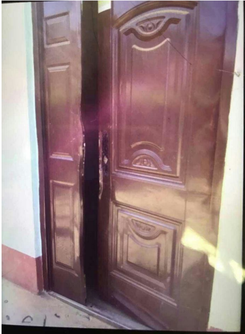
Door broken to enter the house