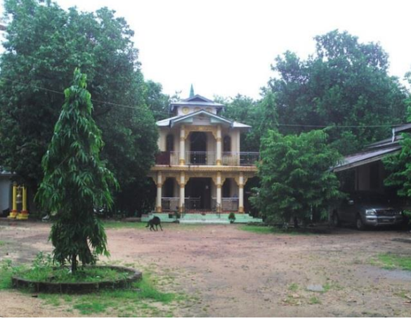
These photos were taken by a KHRG community member in Dooplaya District/south Kayin State. The first photo shows a section of the Asian Highway and was taken on July 22<sup>nd</sup> 2015, between Myawaddy and Kawkareik Town, Dooplaya District. The second photo was taken on 21<sup>st</sup> July 2015 in Kawkareik Town, Kawkareik Township, Dooplaya District and shows G--- monastery, where the displaced villagers were staying, having fled the fighting between the Tatmadaw and DKBA soldiers.

On July 7<sup>th</sup> 2015, a primary school building in Kawkareik Town was hit and damaged by a grenade reported to have been fired by two DKBA (Benevolent) soldiers. However, no students or teachers were harmed as the incident took place at 7:00 am before the school had opened for the day. The schools in these villages were forced to close temporarily out of fears over the safety of the students, who were consequently unable to attend their lessons.<sup>59</sup>