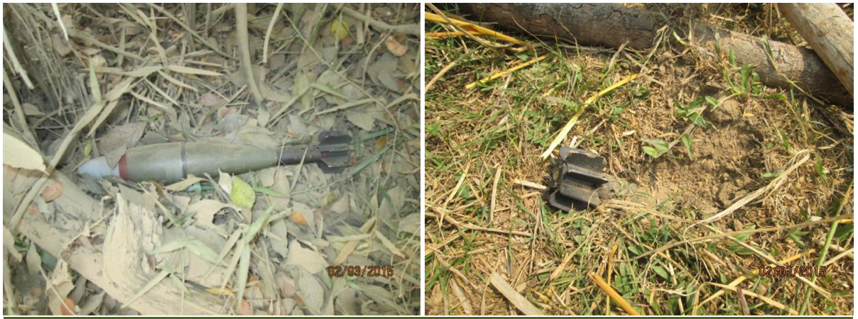
The above photos were taken by a KHRG community member in C--- village, Kawkareik Township, Dooplaya District/south Kayin State on March 2<sup>nd</sup> 2015. These photos show mortars which did not explode during the clash between the BGF and Tatmadaw battalions from Kyaikdon Town and DKBA (Benevolent)'s Na Ma Kya unit, which later became part of DKBA (Buddhist) splinter group.<sup>41</sup> The first photo shows the unexploded mortar at the scene that was fired by Na Ma Kya's unit. The second shows the unexploded mortar that was fired by Tatmadaw soldiers.<sup>42</sup>

Apart from unexploded ordnance due to military trainings, KHRG has also received reports of unexploded ordnance and remnants of war left on villagers' land due to recent clashes between armed actors.