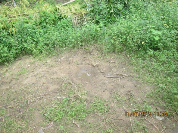
These photos were taken by a KHRG community member on July 11<sup>th</sup> 2015, in Kawkareik Town, Dooplaya District/south Kayin State. The first photo shows a section of roof that was damaged when a grenade fired by DKBA soldiers from an M79 grenade launcher hit the primary school building in Chaung Taung section. The second photo shows where another grenade hit the ground and exploded within the school grounds. No students were injured by either grenade.<sup>60</sup>

A villager named Naw E--- reported to KHRG that two villagers were shot and killed between Bway Moh Hklay and Beh Htee Hta villages by Tatmadaw soldiers on July 6<sup>th</sup> 2015, whilst