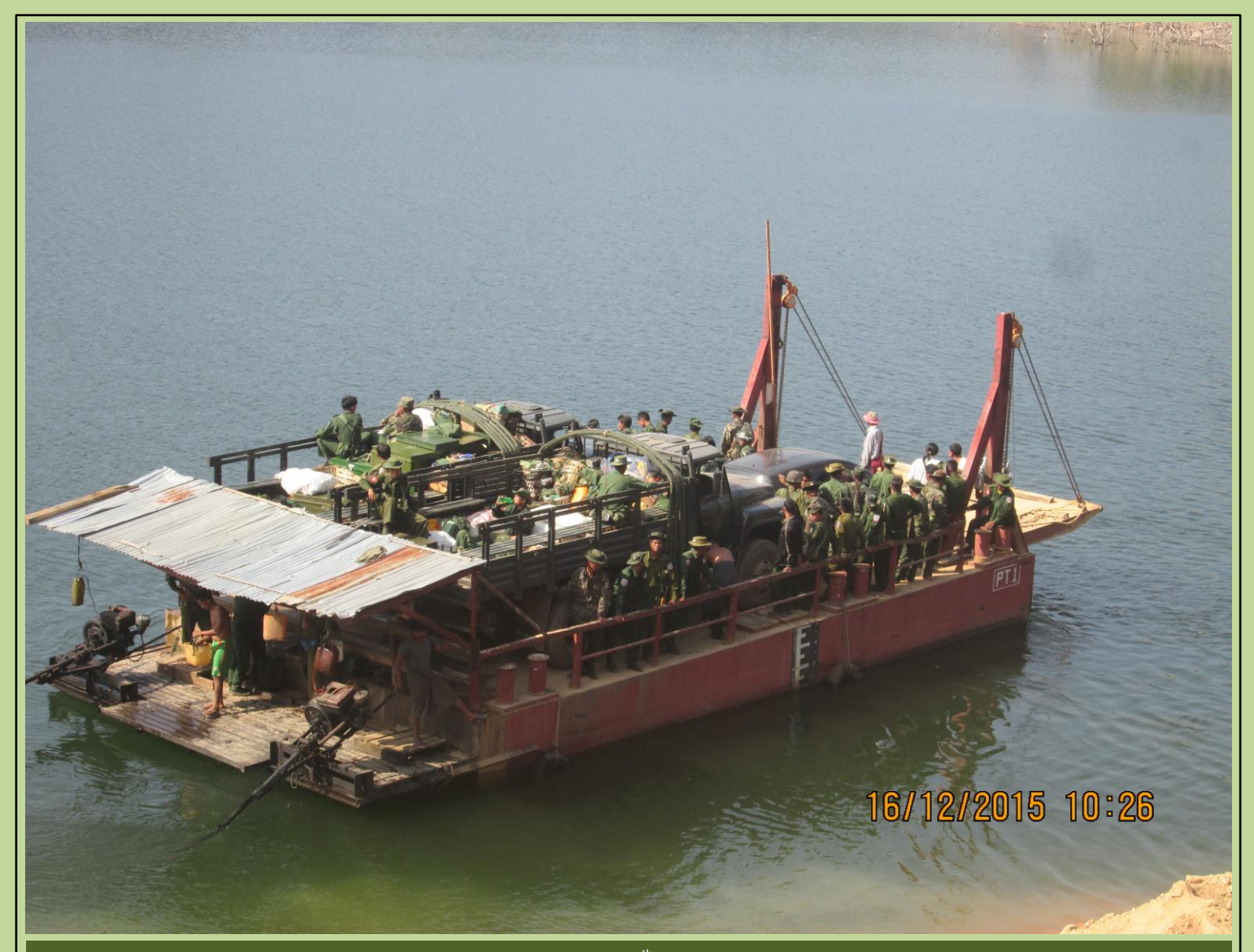
This photo was taken by a KHRG community member on December 16<sup>th</sup> 2015, near Hkler La village, at a location known as P'Leh Wah, in Htantabin Township, Toungoo District/east Bago Region. It shows Tatmadaw soldiers crossing a river with rations and troops.

"The villagers reported to me that they [Tatmadaw] have the unusual activity after the ceasefire as they send more rations. Although we do not encounter with them, we looked from [far] away and saw that they sent more of their rations and ammunition. Therefore, the villages dare not go back [to their village] to work [on their fields]. [...] There is no activity like patrolling and burning [houses] like they did before. There is activity like sending their rations and ammunition. [...] The opinion of the villagers is that although there is the ceasefire, it is not a genuine ceasefire so the villagers do not go back to live in their village."