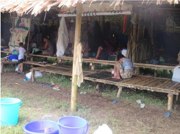
These photos were taken on October 6<sup>th</sup> 2016 by a KHRG community member in an Internally Displaced Persons (IDP) camp in Myaing Gyi Ngu area, Hpa-An District/central Kayin State. It shows the villagers that were displaced due to the recent clashes in Meh Th'Waw area, Hlaingbwe Township, Hpa-An District/central Kayin State. <sup>93</sup>