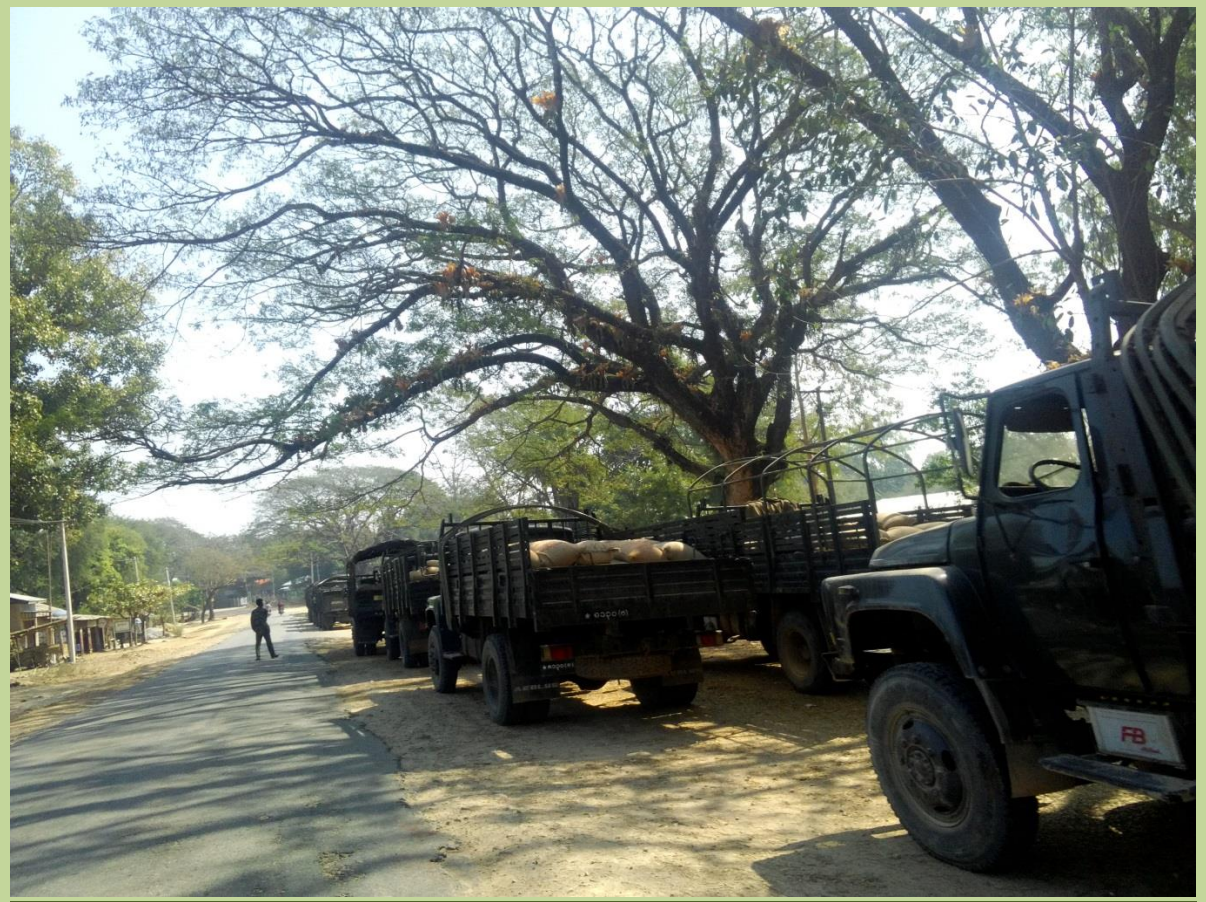
This photo was taken by a KHRG community member on on January 23<sup>rd</sup> 2016, in Chaung Kya village, Htantabin Township, Toungoo District/east Bago Region. It shows Tatmadaw vehicles transporting rations. More than 15 vehicles fully loaded with rations and soldiers were observed.<sup>1</sup>