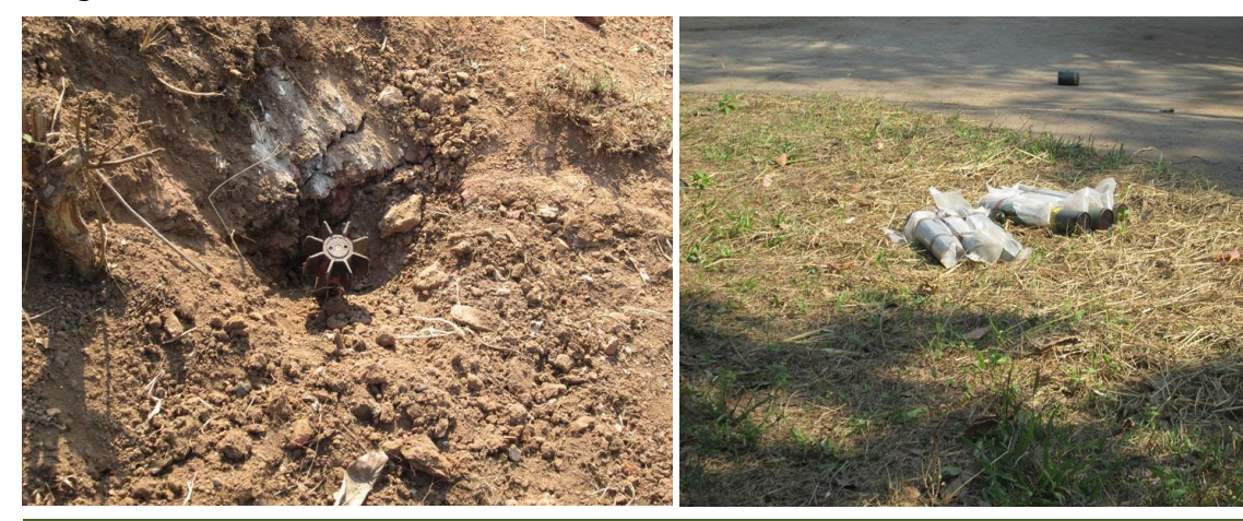
These photos were taken on January 19<sup>th</sup> 2015 in Win Yay Township, Dooplaya District/south Kayin State. The first photo shows an unexploded rocket that was carelessly left after the Tatmadaw military training exercise. In total seven rockets were seen, some of which were fired, some of which were not. The second photo shows the shells in their packaging which were left by LIB #310 near U M---'s farm. A villager said that it is not the first time that they have left shells in their packaging.<sup>40</sup>

afterwards because unexploded ordnance and packaged shells are left behind on the villagers' lands.