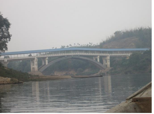
The above photos were taken on May 6^{th} 2016 at Htee Lah Beh Hta Bridge, Htee Tha Daw Hta village tract, Bu Tho Township, Hpapun District/northeast Kayin State. They show the bridge that was commissioned by Sayadaw U Thuzana and the DKBA (Benevolent) and the checkpoint set up by the Tatmadaw and BGF after the DKBA (Benevolent) left the area. <sup>30</sup>

The village tract secretary of another village tract in Lu Thaw Township, Hpapun District, also spoke to KHRG in April 2016 and mentioned that the Tatmadaw are strengthening their bases instead of removing them, as well as sending rations, materials and ammunition: