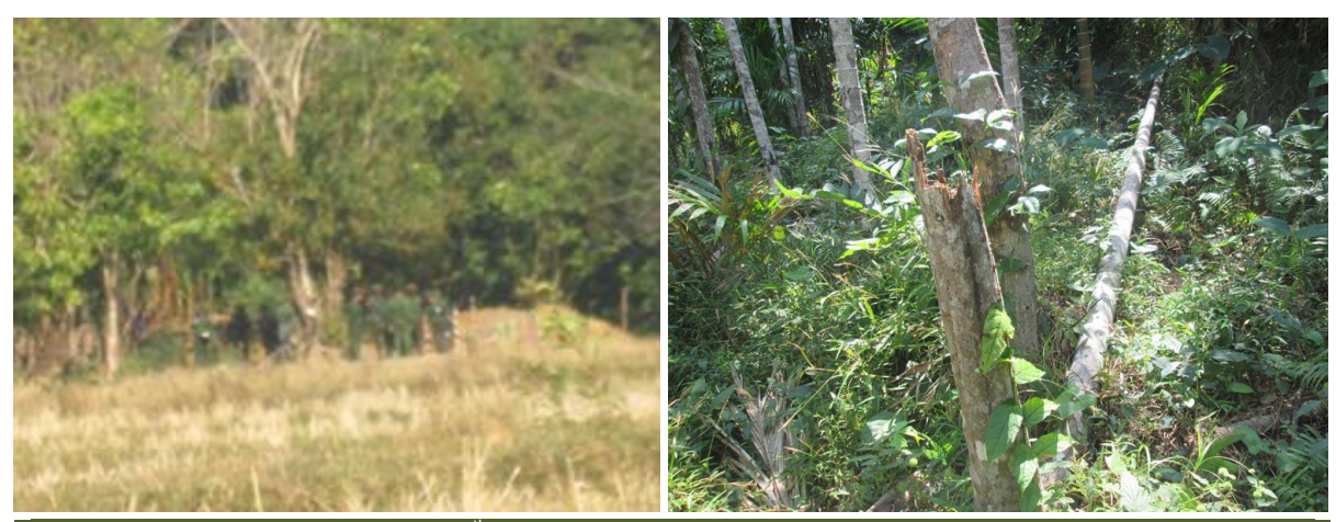
These photos were taken on January 19<sup>th</sup> 2015 in Win Yay Township, Dooplaya District/south Kayin State. The first photo shows LIB #310 engaging in heavy weapons target training. The second photo shows a farmer's durian and betel net trees which were hit by shrapnel from previous heavy weapons target practice in 2014 by LIB #310. These photos form part of a larger published photo set.<sup>38</sup>

KHRG community member, Win Yay Township, Dooplaya District/ south Kayin State, June 2015<sup>37</sup>