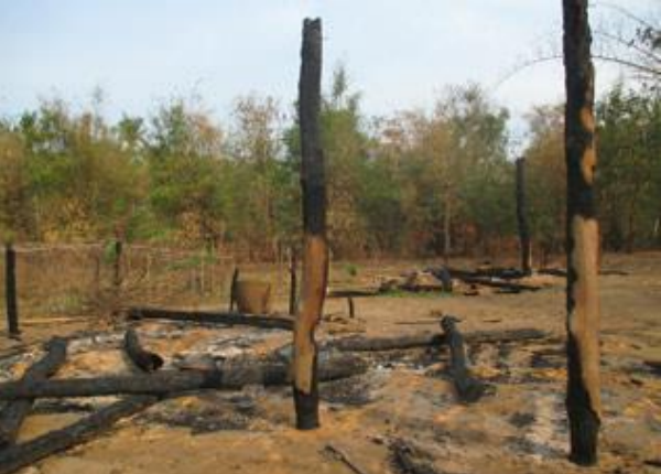
These photos were taken by a KHRG community member in March 2016 in Tha Nay Moo village, Kawkareik Township, Dooplaya District/south Kayin State and show houses burned down by the Tatmadaw and BGF. Reportedly villagers were able to return to their village only after March 2016.