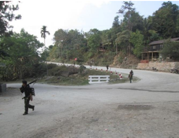
These photos were taken on February 1st 2015 in Thandaunggyi Township, Toungoo District/north Kayin State. The photo on the left shows Tatmadaw soldiers patrolling the road near Shwe Nyaung Pin village. The photo on the right shows KNU soldiers passing over a road as they go from one village to another to meet with the local villagers. However, the Tatmadaw has put security patrols on the both sides of the road where the KNU soldiers are travelling and the local villagers report feeling afraid.<sup>24</sup>

The village head of K--- village in Kawkareik Township stated to KHRG that he is worried about an army camp placed in his village due to abuses that have occurred in the past. For that reason he fears that similar abuses could happen again.