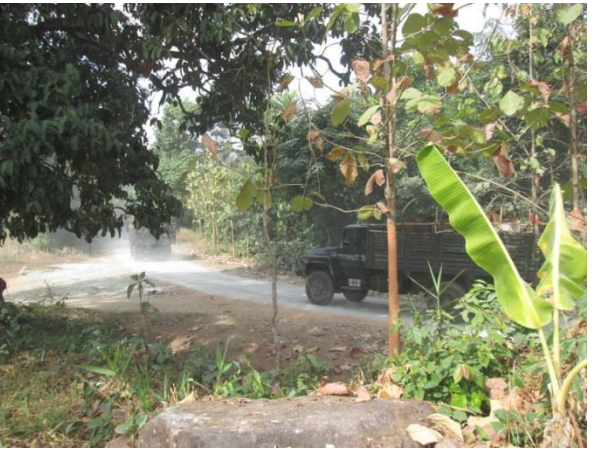
The above photos were taken on December 21<sup>st</sup> 2014 in T---, Thandaunggyi Township, Toungoo District/north Kayin State. They show the Tatmadaw transporting horses, which were then used to transport rations to the frontline, where transport by truck over the rough terrain is not possible. The local community reported that this occurred while they were celebrating the Karen New Year on December 21<sup>st</sup> 2014. As it is during the preliminary ceasefire period, the local villagers reported being worried for the stability of the ceasefire after witnessing this activity by the Tatmadaw.<sup>32</sup>